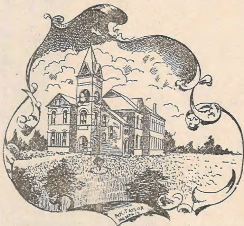
Mountain Home Baptist College, Mountain Home, Ark