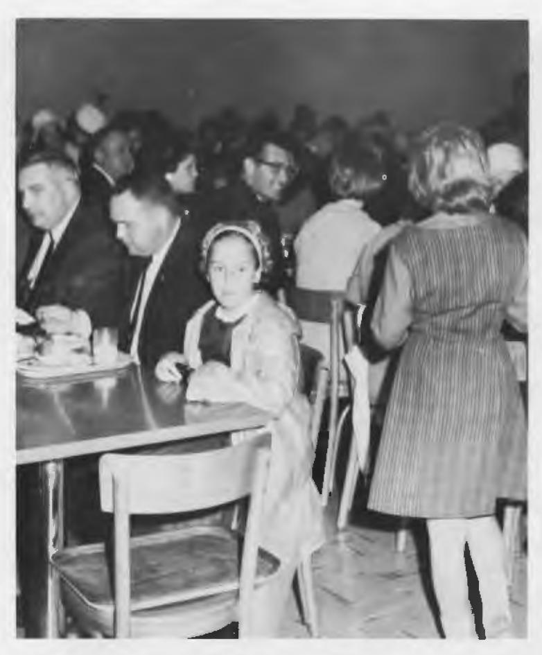
\mbox{\bf Hundreds} of grads and parents here for the OSC-Henderson game enjoy Thanksgiving dinner in the school dining hall.