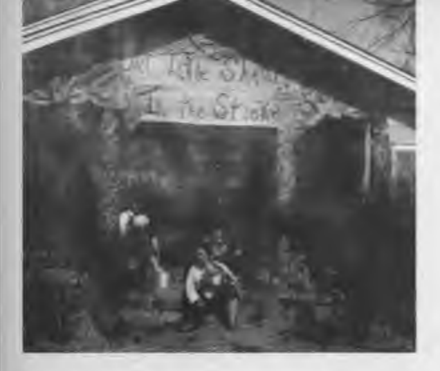
Barefoot and fancy free, girls from Blake Dorm "rest a spell" on the porch. Blake is the winner of the dorm display based on rivals, the Ozarks Mountaineers.