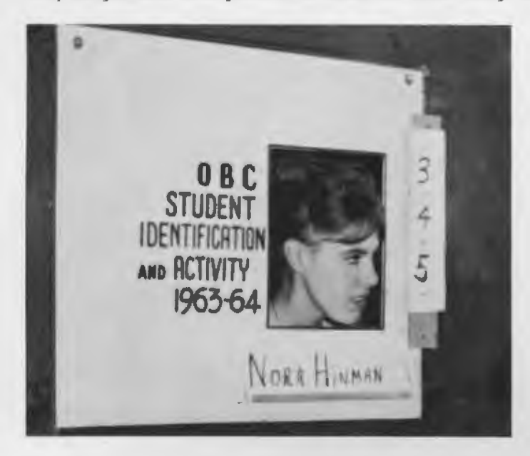
How do these "mug shots" on activity cards always manage to look so awfull They get us into the games, anyway.