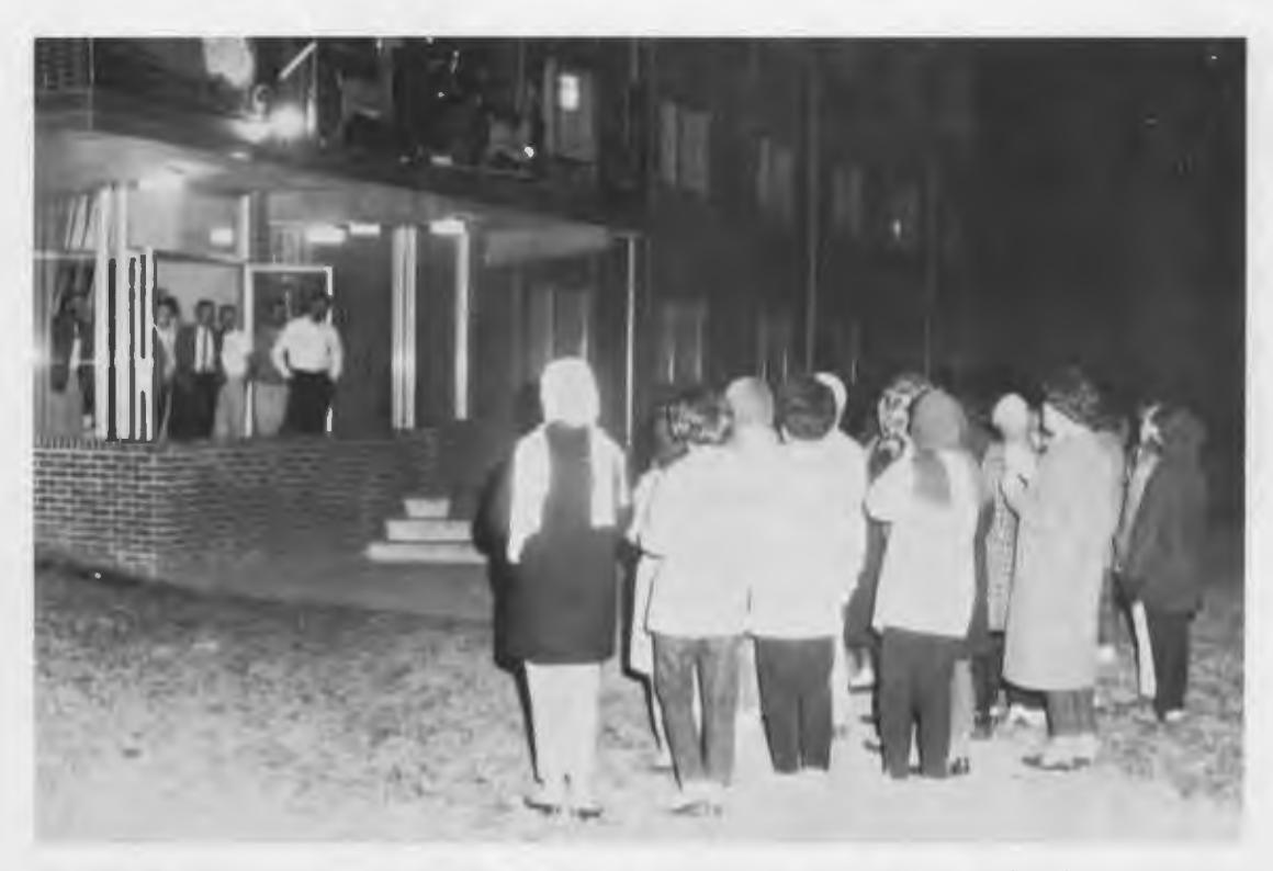
Assuming the boys' nightly rounds, the Gamma Phis go caroling. The social clubs did much to boost the campus Yuletide spirit.