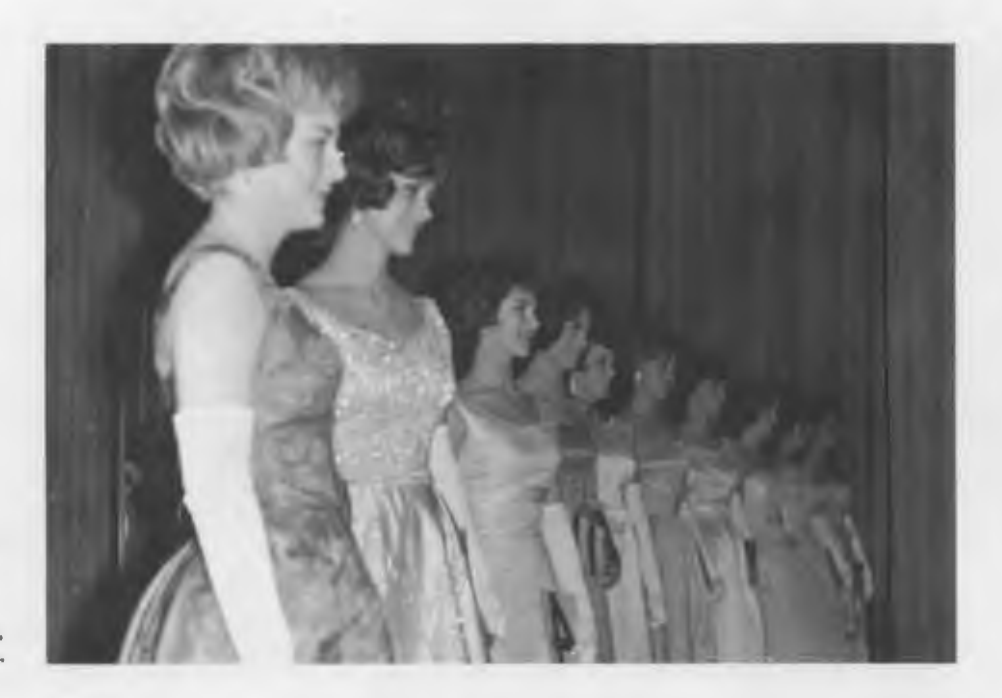
Ten finalists are called back onto the stage, before the announcement of the winners.