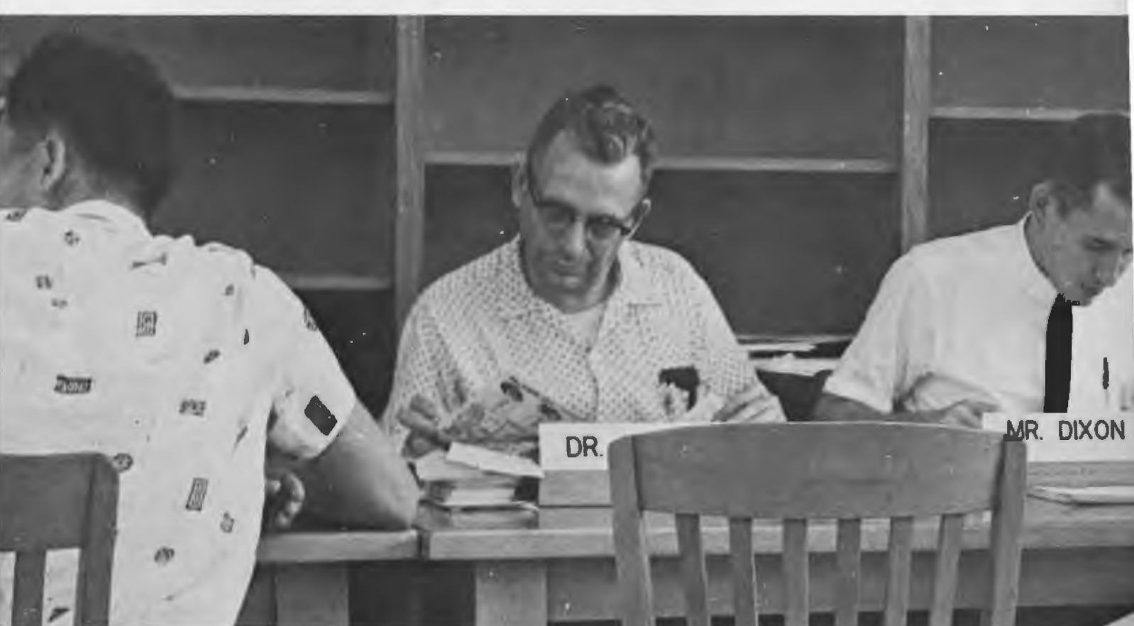
That I-o-n-g process of registration we approach with the eagerness of getting started again, but surely are glad when we've gotten all our classes and lasted through the business line.