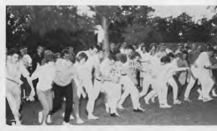
The winners of the three-legged race get a "special surprise." But, wait! That's my foot your're running off with.