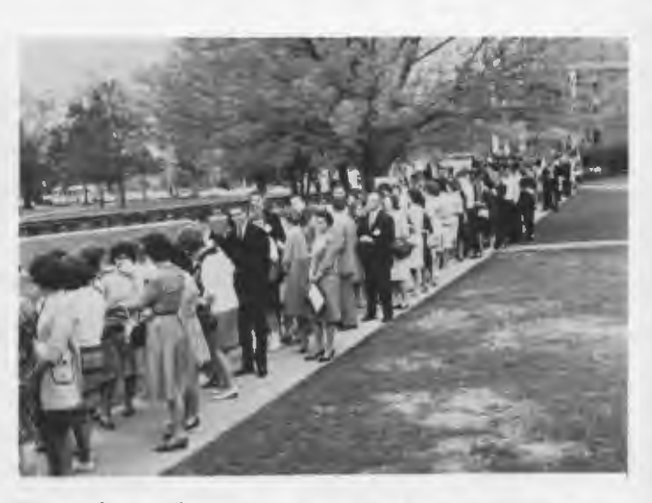
"We might as well give up and go to the student center for a hamburger." Throngs of high school seniors wait in an endless line, extending past the library, to be served lunch in the cafeteria.