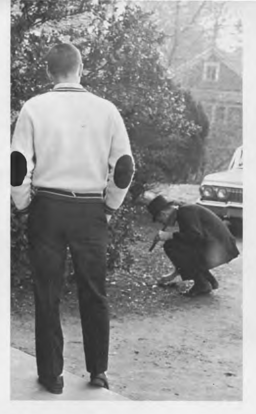
Really, now! Don't you think worm hunting is going a little too far, S's?