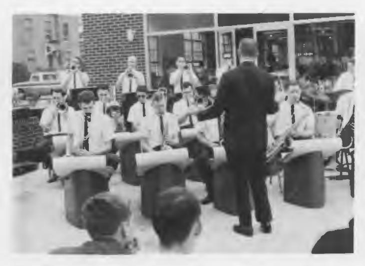
Tiger Day brings out the showmanship in everybody, including the Ouachita jazz band who performs by the dining hall for visitors.