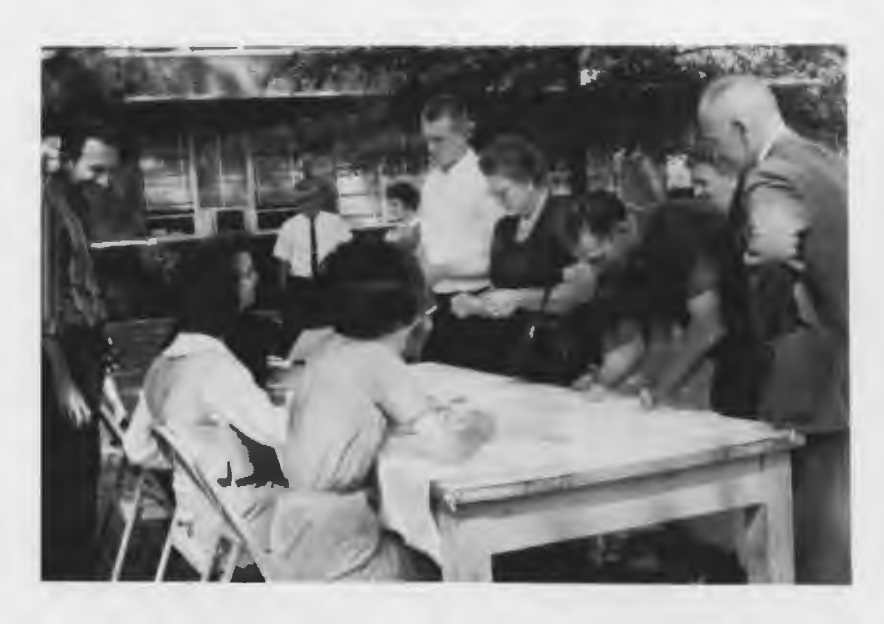
Approximately 500 deds register on October 12 and are antertained with a talent show, free supper, and game.