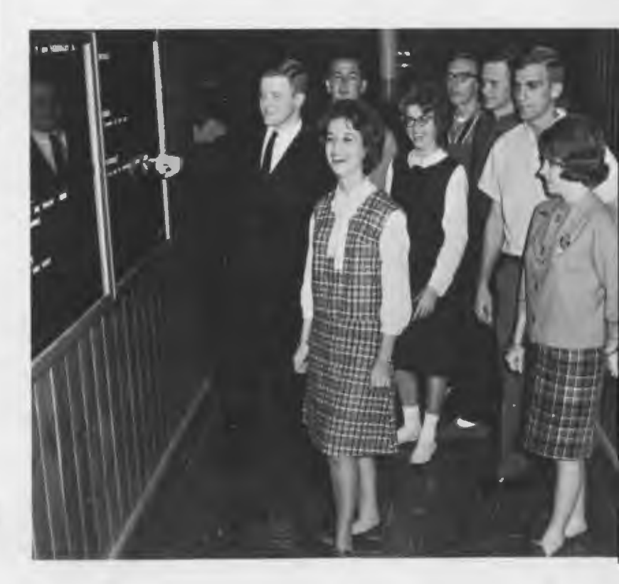
The whole school benefited from the bulletin boards installed by the Senate at the student center and cafeteria. They notified us of upcoming activities and menus.