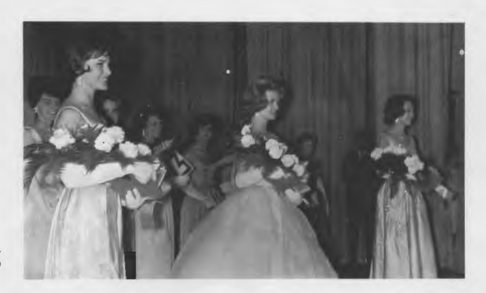
Thrilled and trembling, the three finalist step out of line with the others to receive their bouquets and applause.