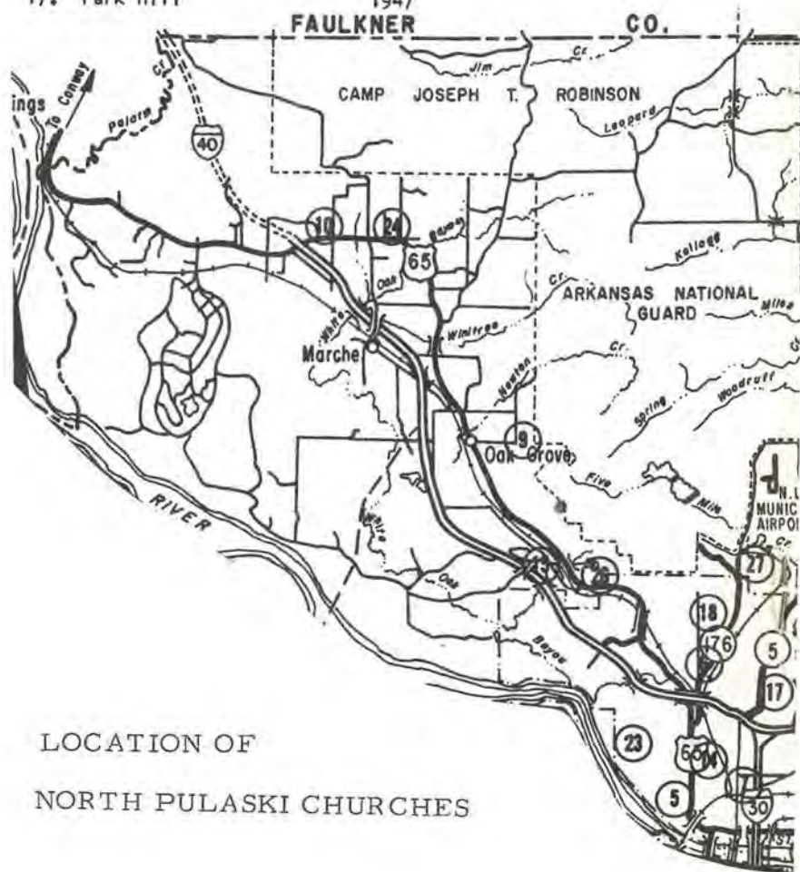
LOCATION OF NORTH PULASKI CHURCHES