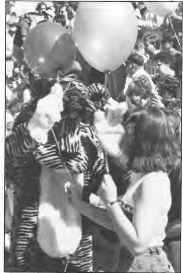
Tiger Mascot 125