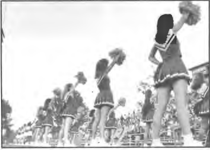
FIRST DEFENSE The spirit squads form a tough line of defense. The Tiger team would not have been complete without them.