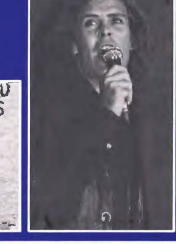
concert captured the full house in Mitchell Hall.