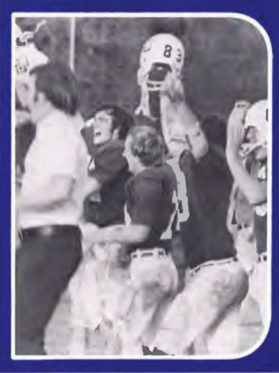
The Tiger football team rejoices after a victory over top-rated AIC opponent Southern State.