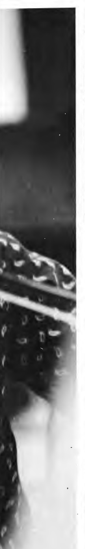
DIRECTING proves to be harder than it looks. Janna Lowry practices in choral conducting class.