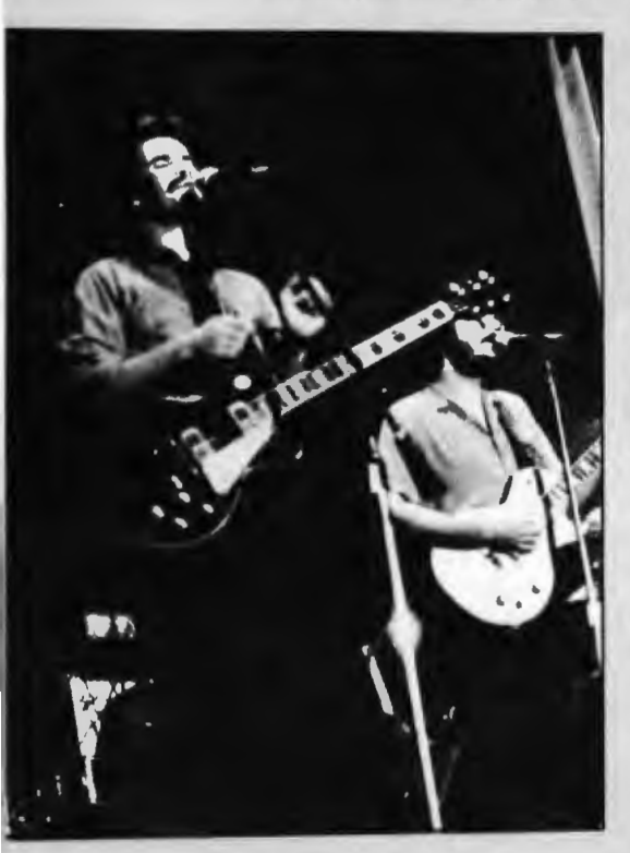
RUSS TAFF'S AUGUST 29 PER-FORMANCE was sponsored by the Student Entertainment and Lecture Fund. Backup musicians were hired from the HSU music department.

SENATOR DALE BUMPERS is questioned by Fran Coulter during his lecture on dwindling energy resources September 14. The event was sponsored by the Joint Education Consortium.