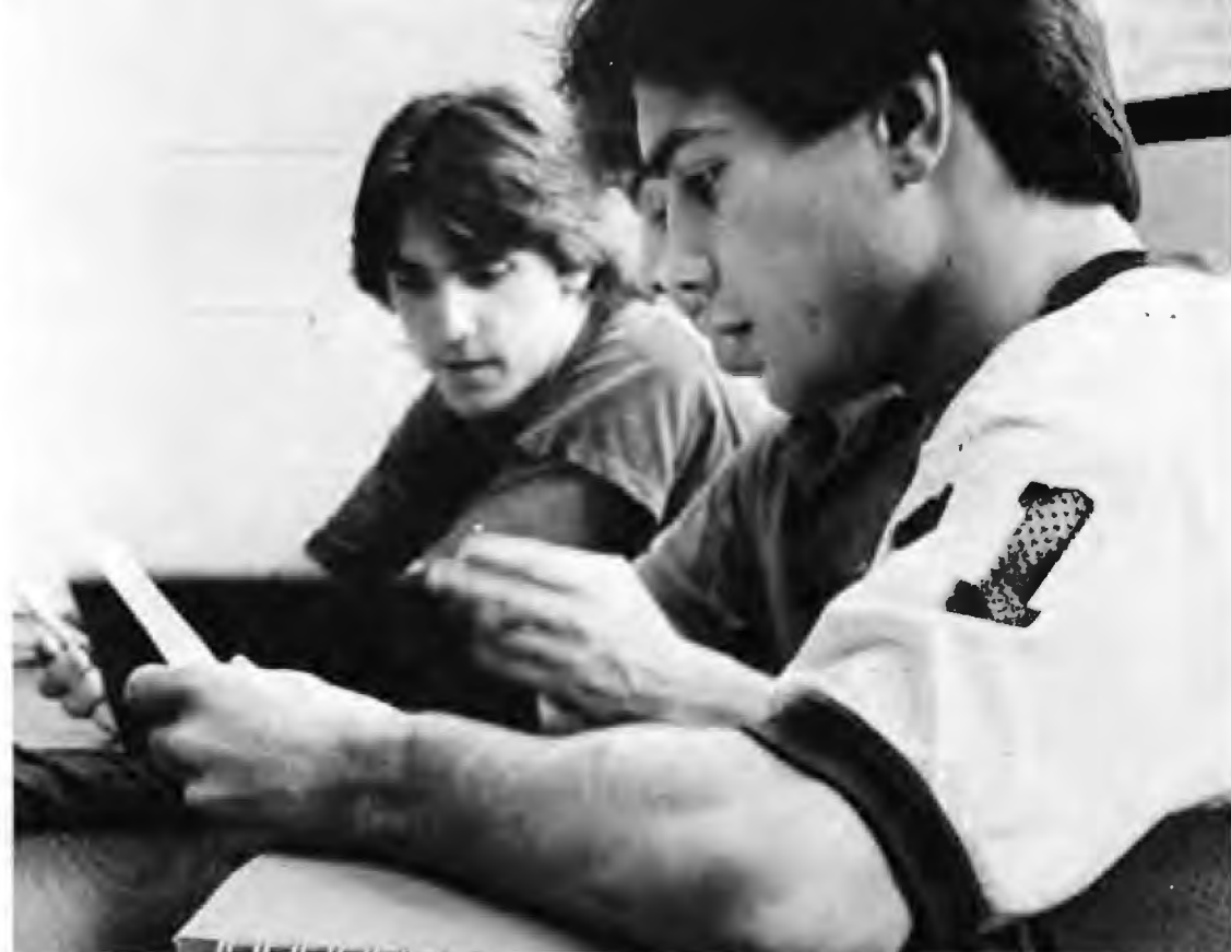
beyond the lab