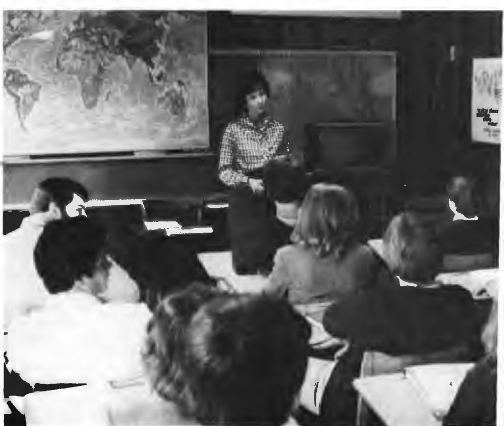
IN A CROWDED CLASSROOM in Terral-Moore, students from all majors learn about the problems of the