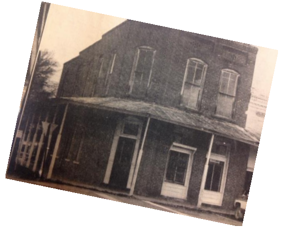
Old Bank Of Amity