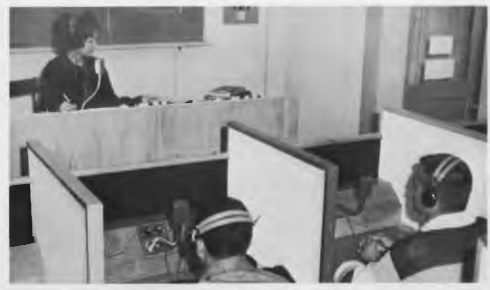
Student participation is a big part of education. Cherry Pemberton conducts a language lab for Miss Gardner.