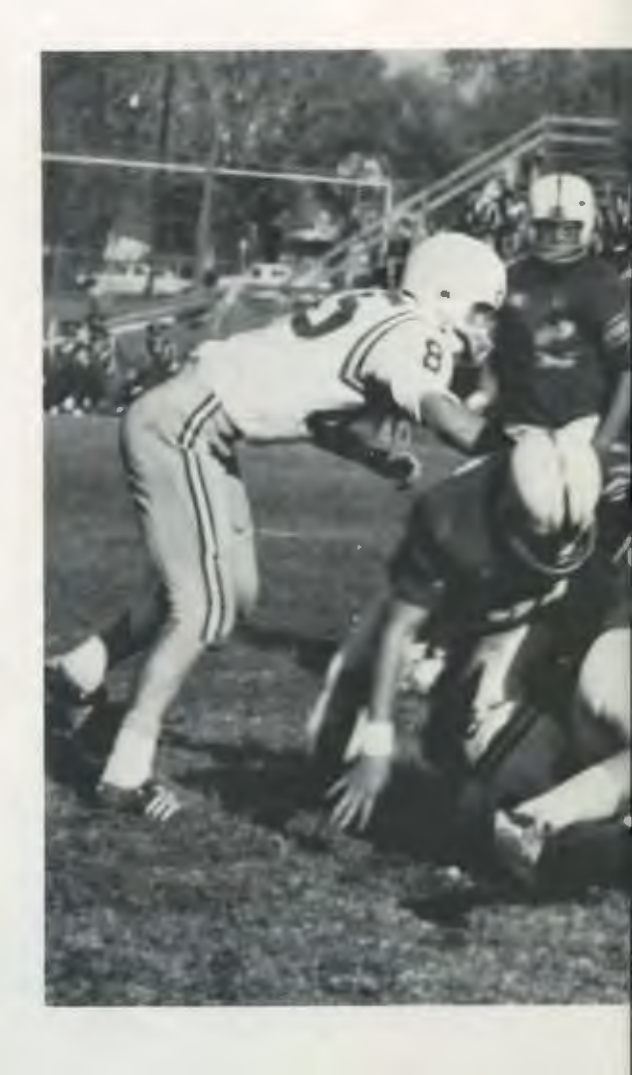
Our students take part in one of the most strenuous of sports — football.