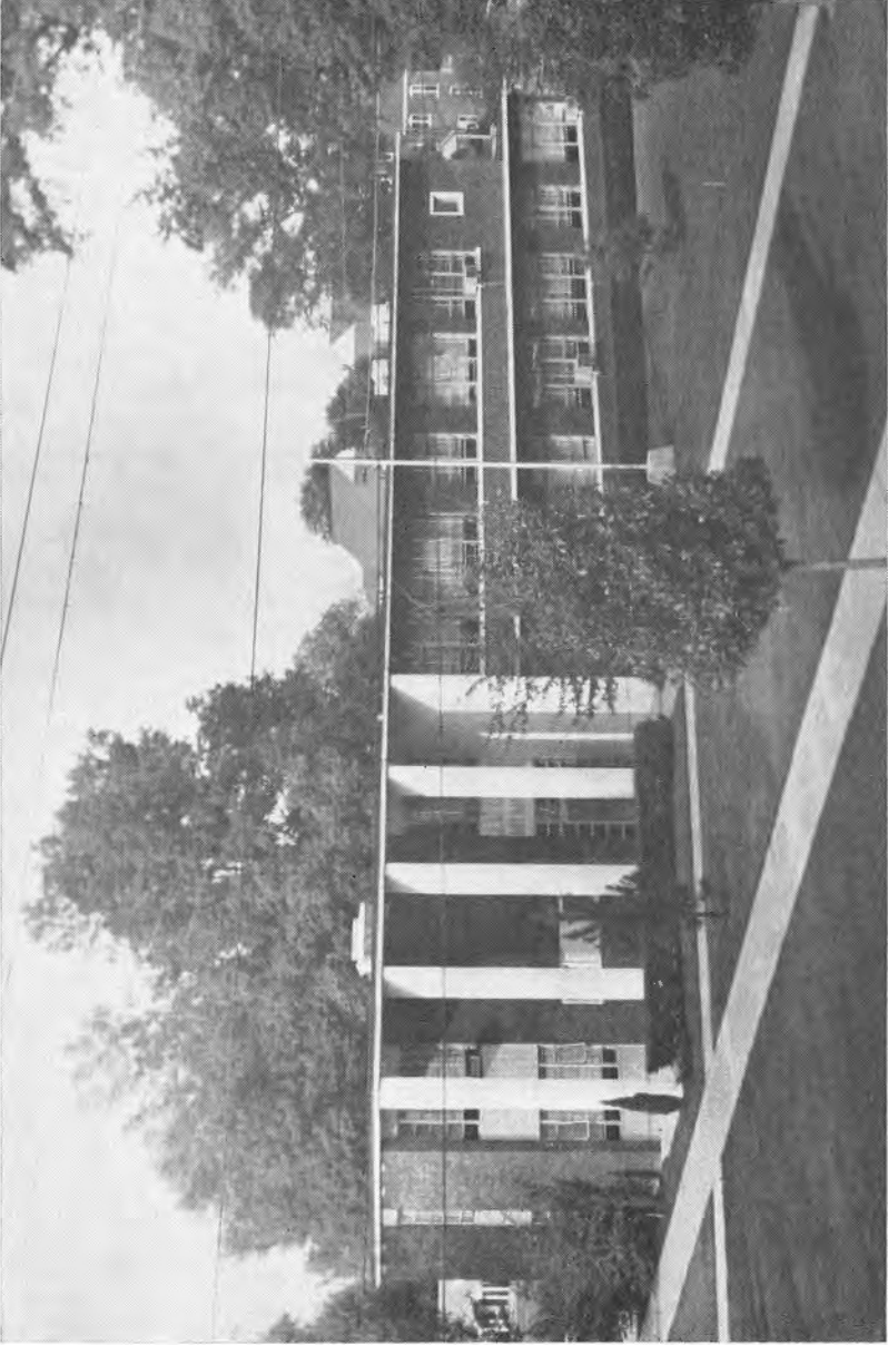
J. R. GRANT ADMINISTRATION BUILDING, ARKADELPHIA CAMPUS