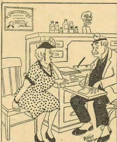
"Make two prescriptions of that. My friend Mrs. Tippel has the same symptoms I have."

When an optimist gets the worst of it, he makes the best of it.