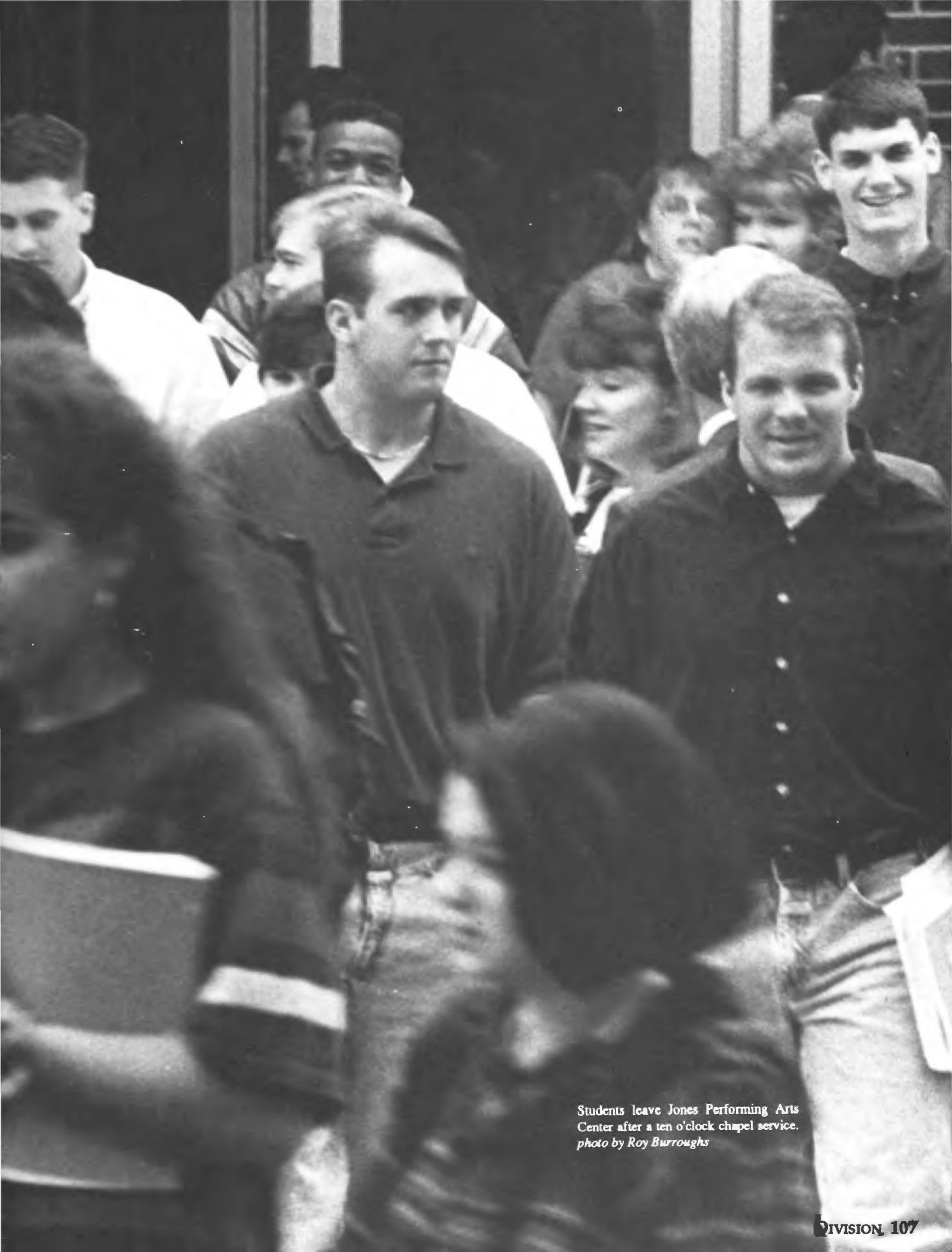
Students leave Jones Performing Arts Center after a ten o'clock chapel service.