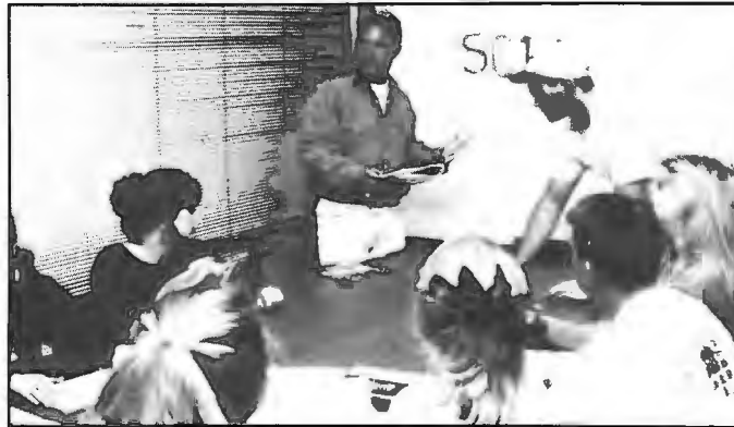
TESTING THE WATERS- Members of the Ad Fed team conduct a focus group to get opinions on their presentation plan from students who weren't involved with the project.