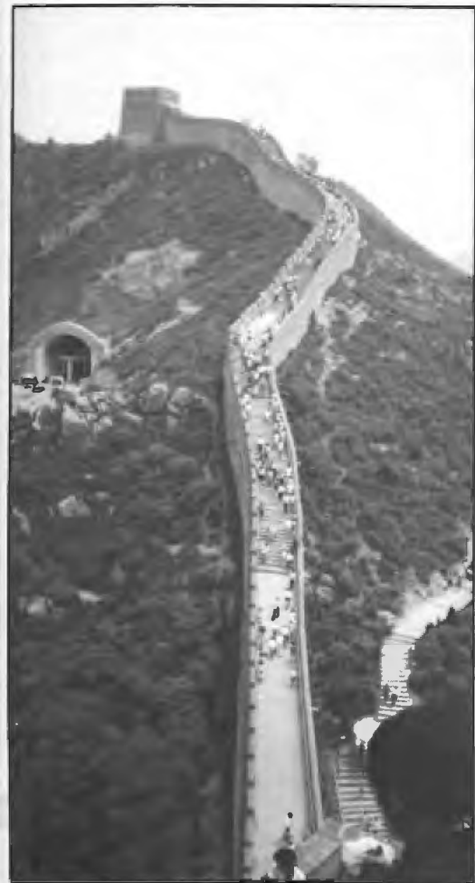
THE WALL -The Great Wall, mobbed with tourists, is a familiar landmark even to those who haven't visited China.