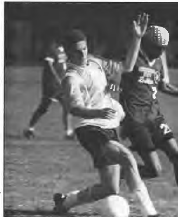
DEFEND A Ouachita soccer player steals the ball from an opposing player.