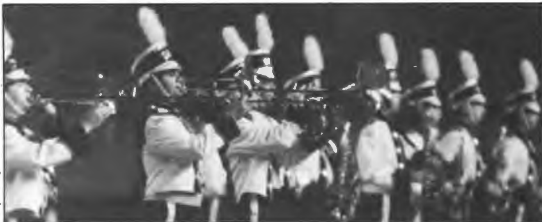
HORNS The marching band keeps fans entertained during halftime.