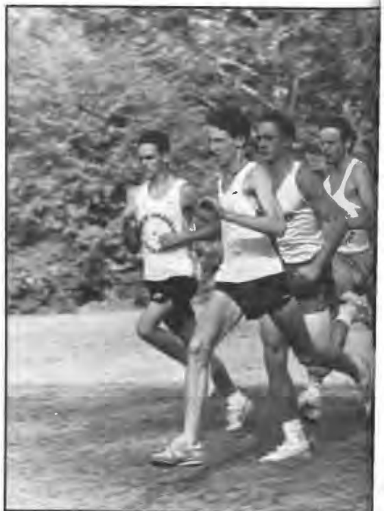
TAKE-OFF The Tiger Cross Country team prepares for its season with a practice meet against Henderson.