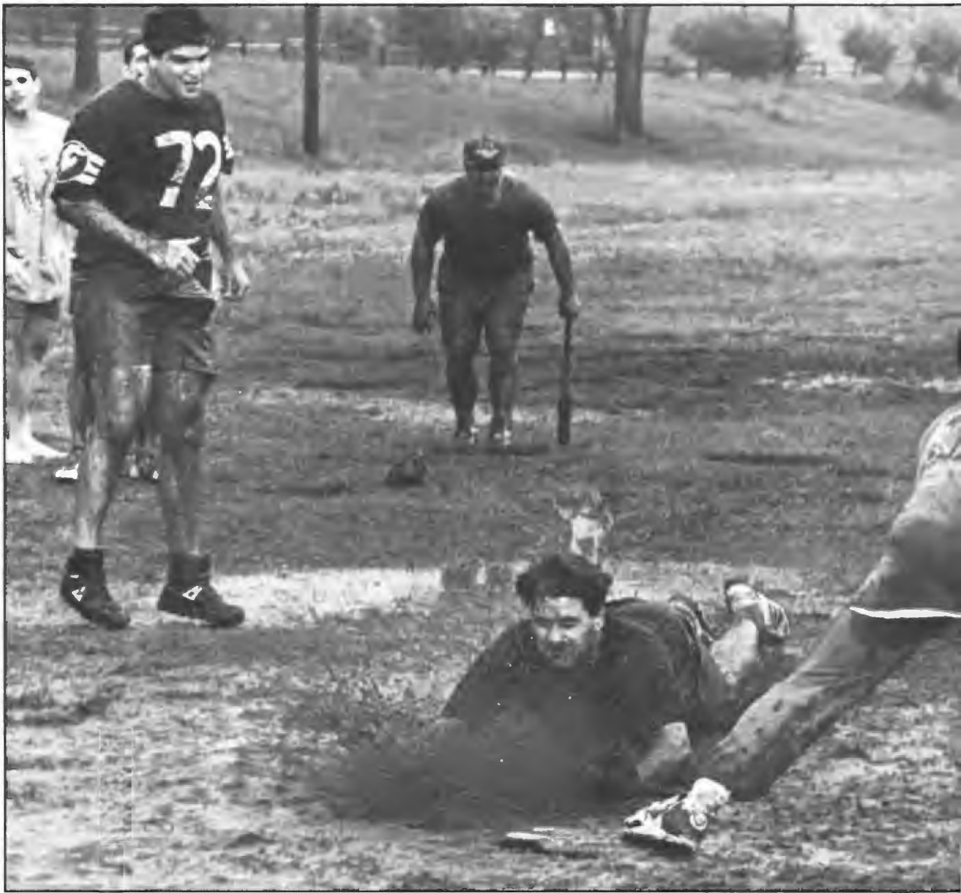
SLOPPY Rain did not stop softball, it simply made it more challenging as well as messy.