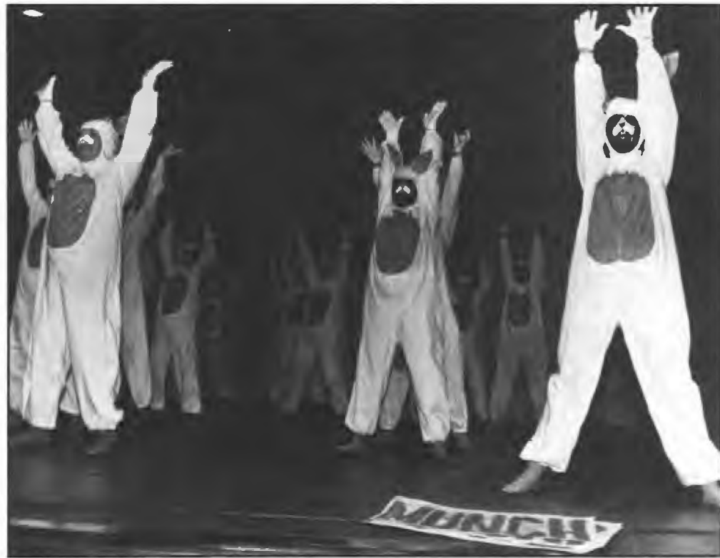
▲ Tri Chi members show their true school spirit during one of the many football pep rallies.