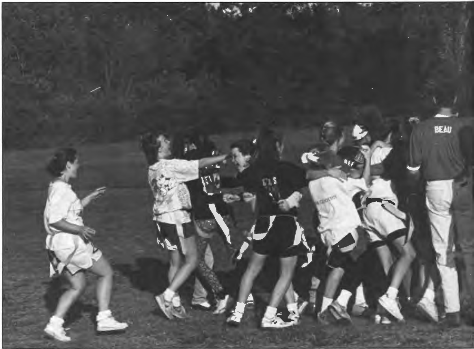
▲ EEE members rejoice in their intramural football victory. For the sixth consecutive year the EEE's were the women's intramural football champions.