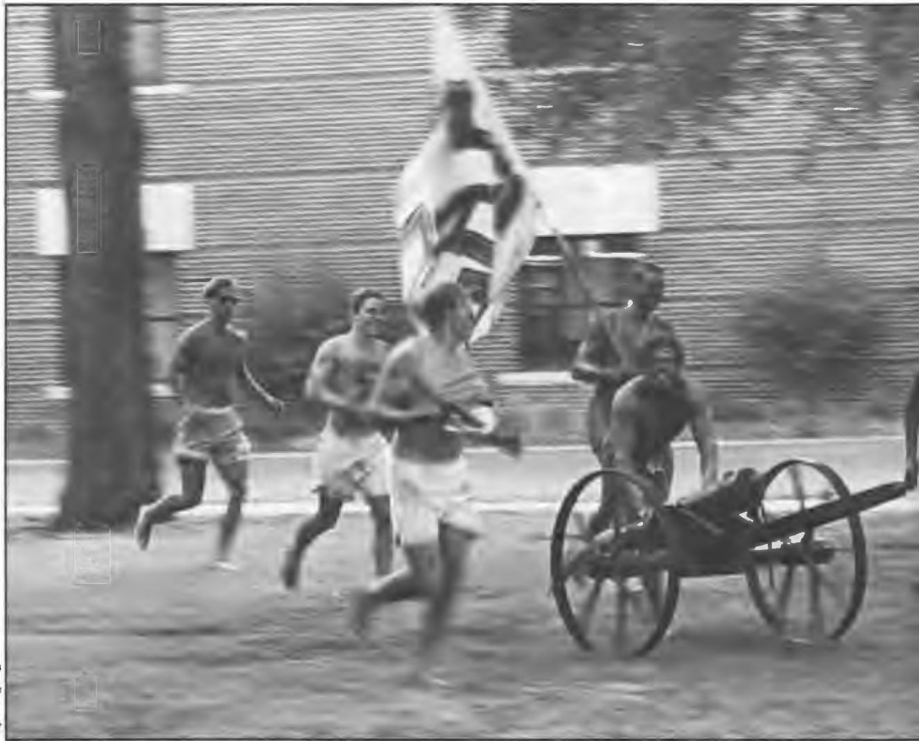
► Members of Sigma Alpha Sigma prepare to shoot off their cannon during one of the football pep rallies. They were famous for firing the cannon at every home football game.