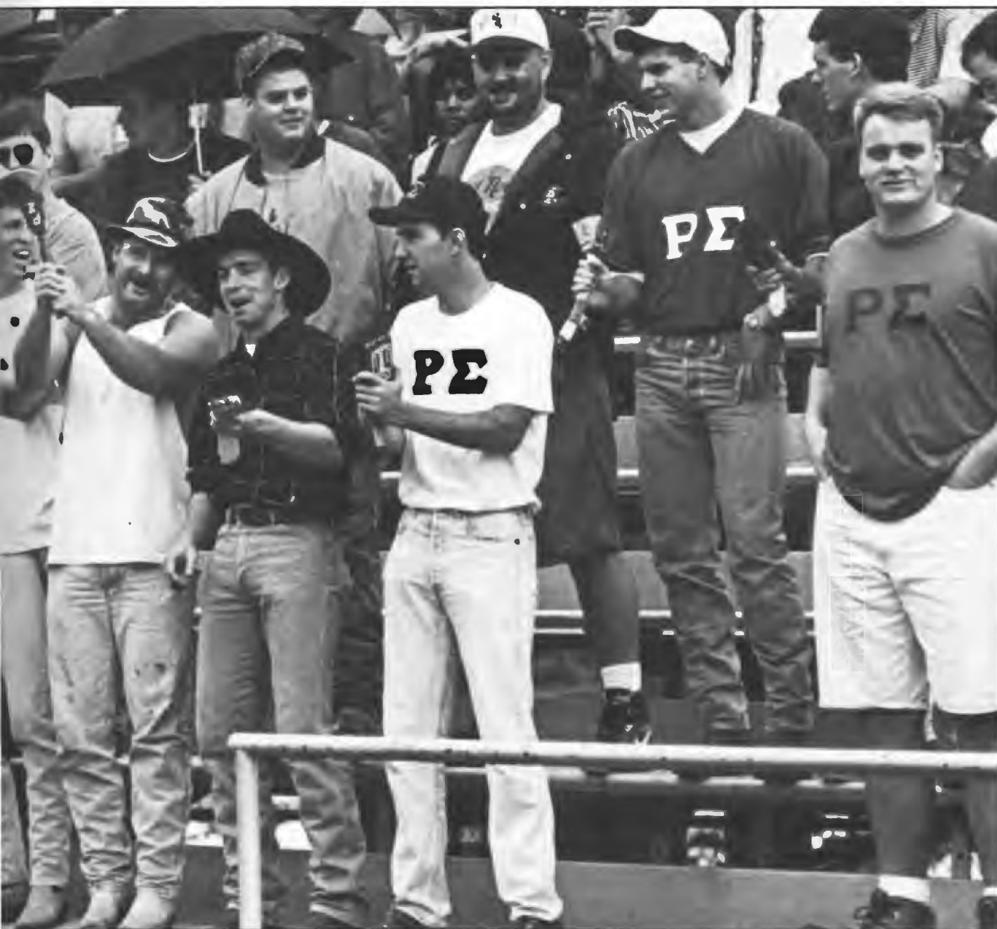
◀ No matter what the weather was like the Red Shirts were always there to show their spirit for the Tigers.