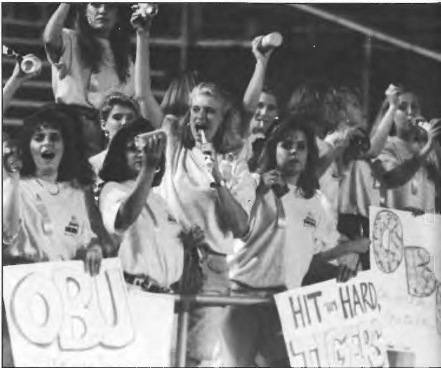
► Chi Delta members support the Tiger football team at the Capital Clash held at War Memorial Stadium. The women won a cash prize of $250 for finishing first in the Capital Clash spirit contest.