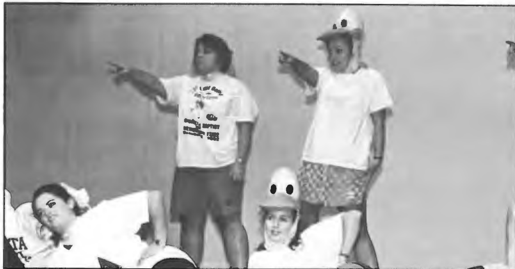
▲ "All Quacked Up." The Chi Delta's work on choreography and songs in preparation for Tiger Tunes. They spent many hours practicing for the competition, in which they received second place.