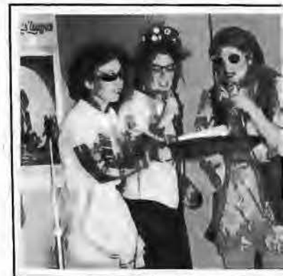
CHI DELTA MEMBERS ENTERTAIN traditional Ruby's Truck Stop program