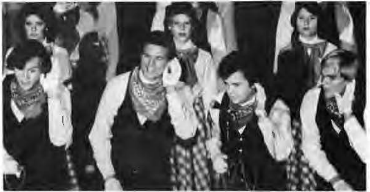
THE BSU PERFORMS for the second annual OSF sponsored Tiger Tunes. BSU took fourth place.