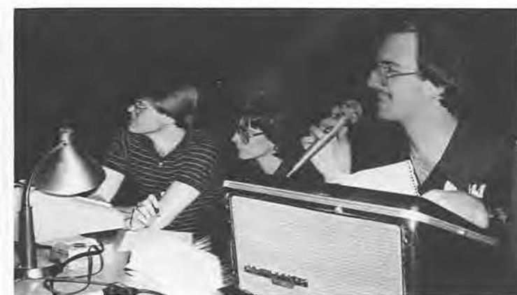
A HOG HAT, a bicycle and a football player are part of the required list for the scavenger hunt devised by SELF during freshman orientation.