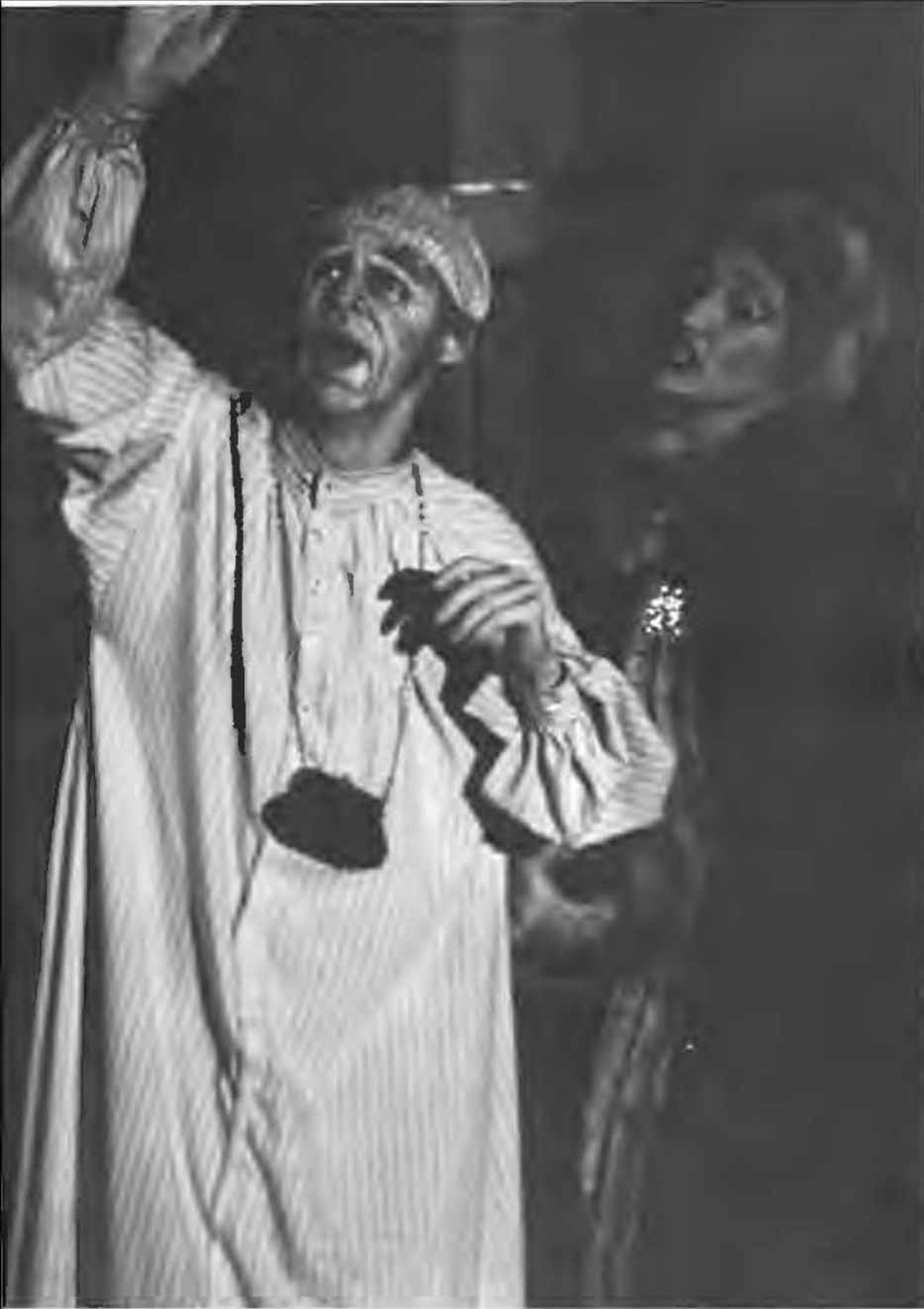
SCROOGE IS AWAKENED by a dream from the spirit of Christmas past, in "a Christmas Carol," a SELF sponsored production.