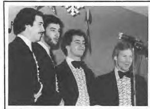
THE EEE BEAUS ENTERTAIN at the annual "Coolside of Yuletide."