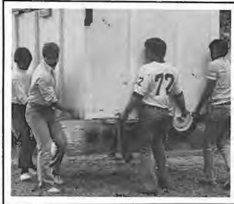
WHEN THE RAINS SUBSIDED , the equipment was moved for the annual twirp week carnival.