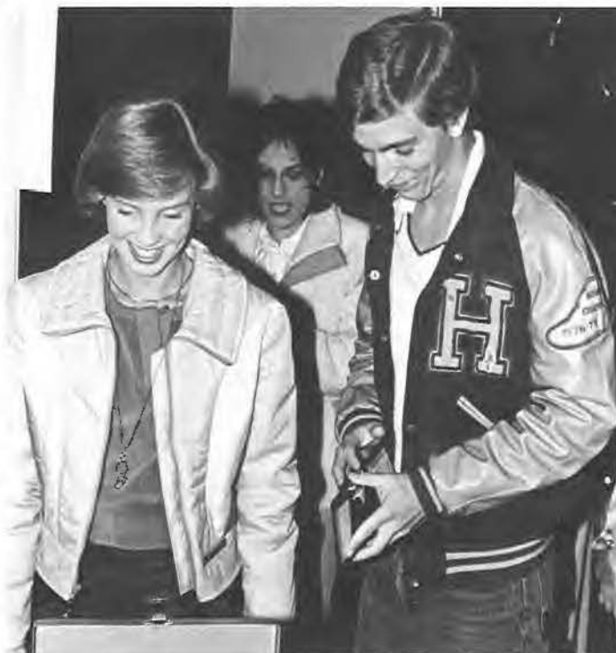
SEVERAL STUDENTS under hypnosis experience feelings of frustration, attempting to explain where their shoes are to mind expert Ken Weber.