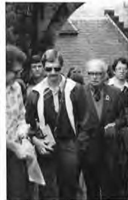
OUACHITA STUDENTS ARE DWARFED and dwarfed by towering York Minster Cathedral on their tour of England and Scotland in early summer.