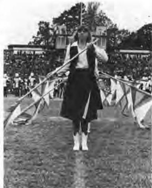
ACCENTING THE BAND'S HALFTIME shows was the Flag Line. They could often be seen on campus rehearsing for the game.

The year was transitional for Sigma Alpha Iota Sorority. Their four weeks of pledging was usually held in the fall. This year they