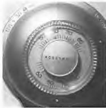
THERMOSTATS ARE KEPT at federally regulated settings of 68 — winter, 78 — summer.