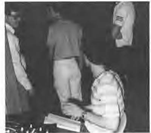
RUNNING THE LIGHTS , sound and curtain are important jobs for Blue Key members who sponsor the Miss OBU pageant.