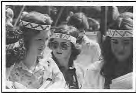
GAMMI PHI PLEDGES discuss the day's duties given by club members.