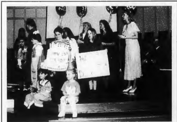
Members of Arkansas Woman's Missionary Union celebrated the 25th birthday of the Mission Friends, Girls in Action and Acteens missions education organizations during their annual meeting March 17-18 in Conway.