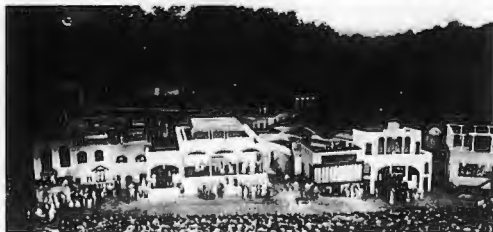
The Great Passion Play