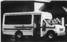
Crusader: 15 passenger • No CDL Required (13 with rear storage compartment)