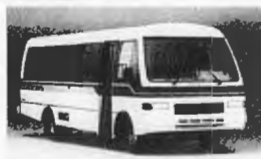
20' to 33' Buses by CHAMPION MOTOR COACH INC.