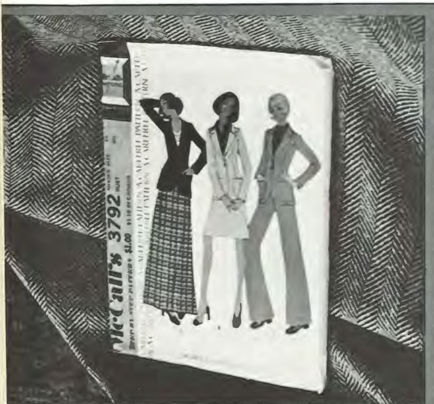
Arkadelphia Fabric Center 616 Clinton 246-2243