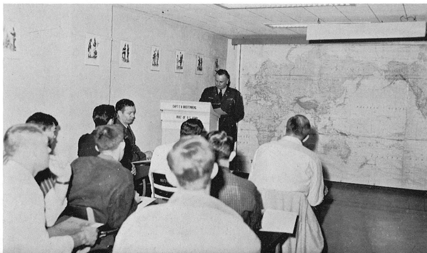
Left: A visiting officer speaks to a group of cadets.