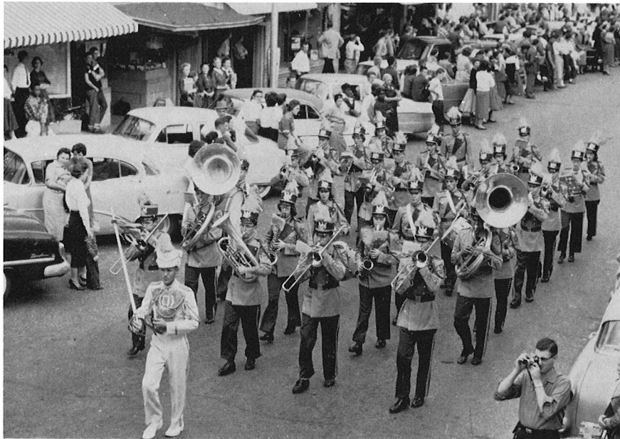
Little but loud, its ranks depleted by absent members who were working and riding on floats . . . but the spirited band joined the parade to wish the team smooth sailing.