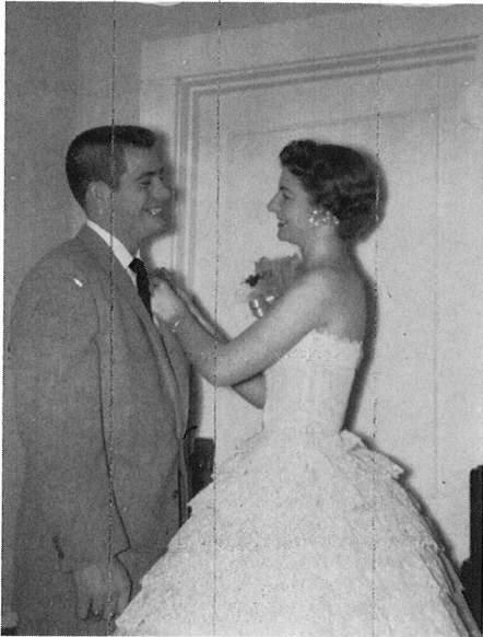
"Now hold still, Monk!"

In the Great Southwest millions of meals are served to school children with Freeman's