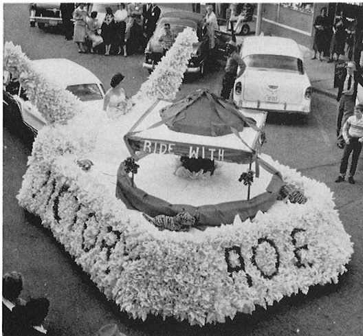
The Alpha Omega Eta men's social club sponsored the above float.