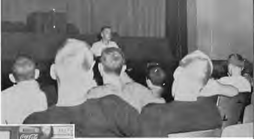
Speech-making was the order of the day.