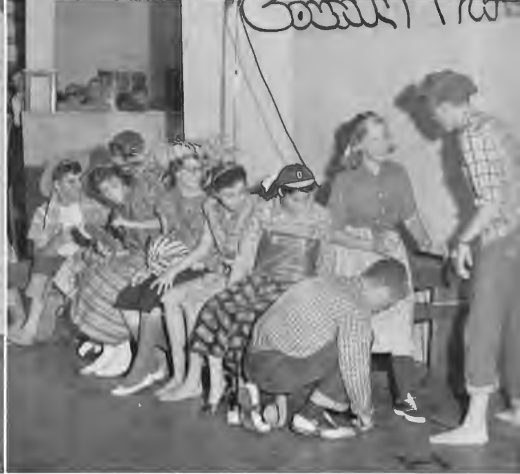
Two rival Freshman groups in action.