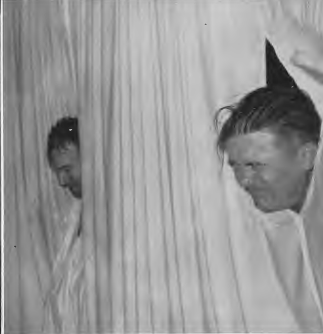
Dodge or Drown!