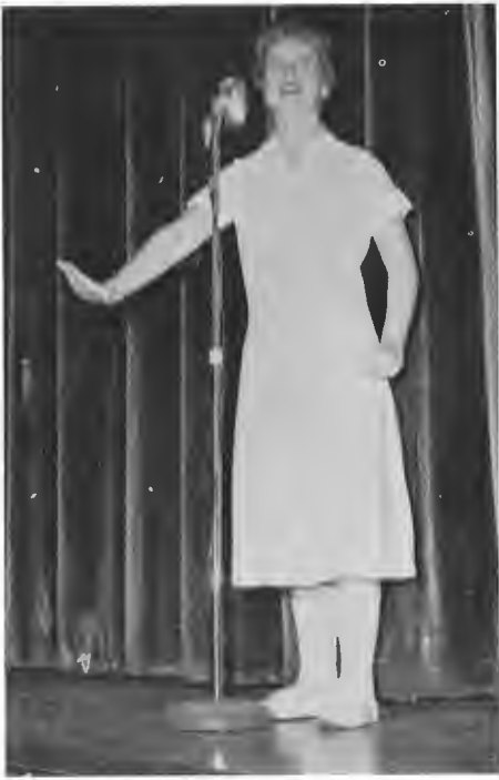
Miss Wittiest in action!