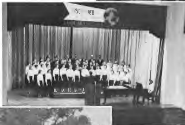
Here is where the conferences took place.