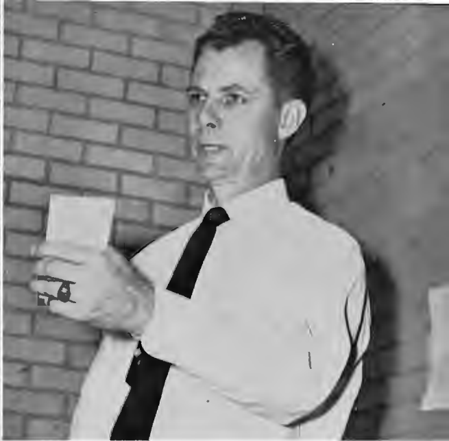
"It is untrue to say that it is false to say that it is true . . ."