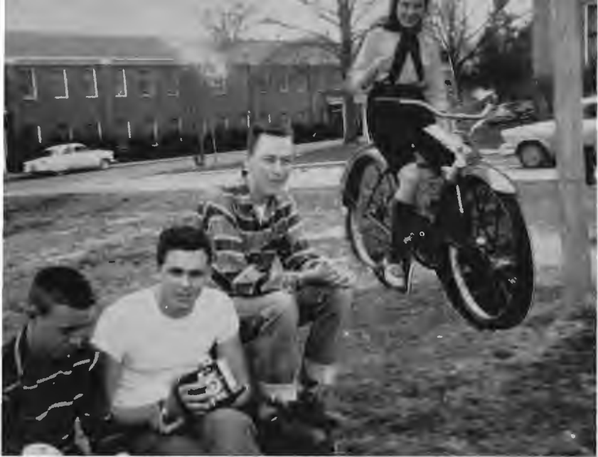
"What! Take a picture of a girl on a flying bicycle? Don't be silly."