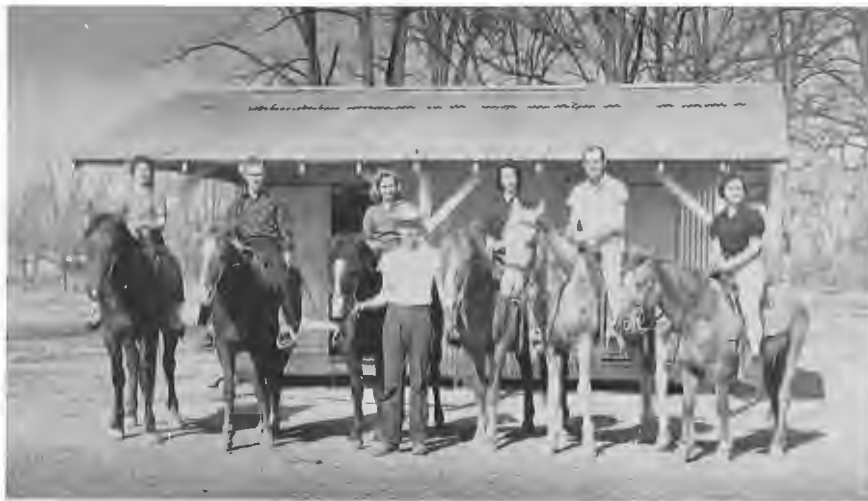
The Rough Riders.