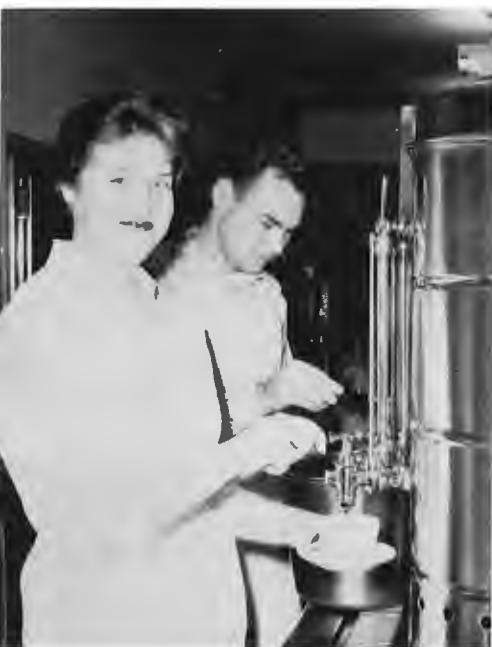
"He wants to turn it but I won't let him."