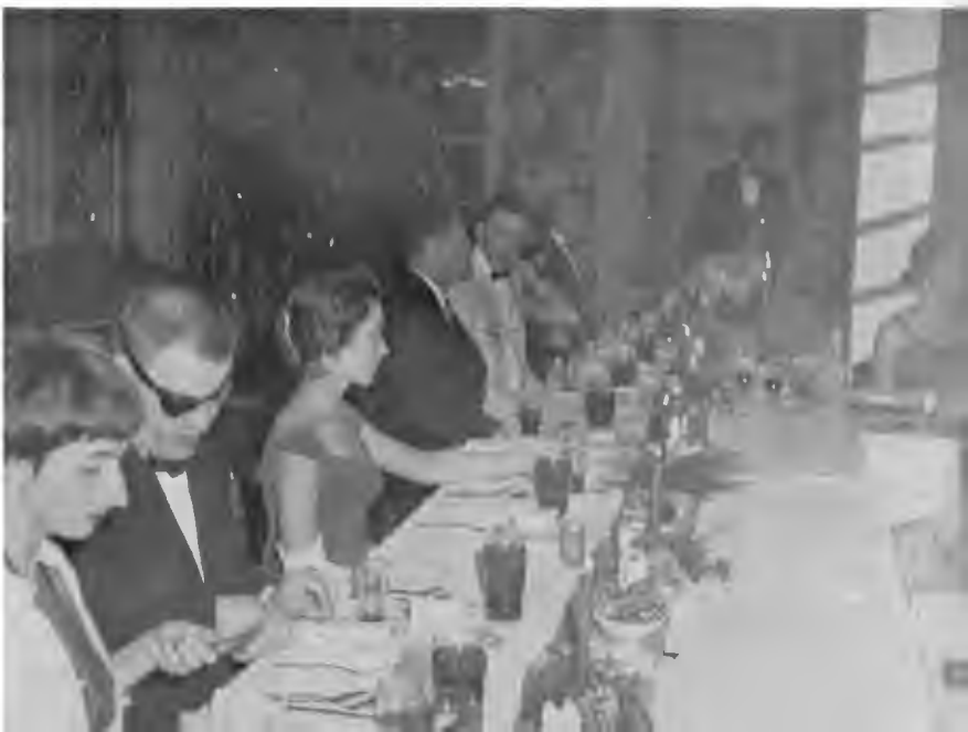
The head table enjoying food fit for a king.