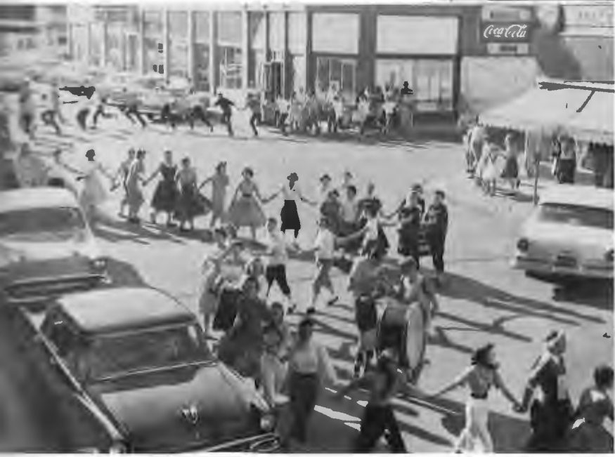
An old game, known at O.B.C. as the "reptile ramble."