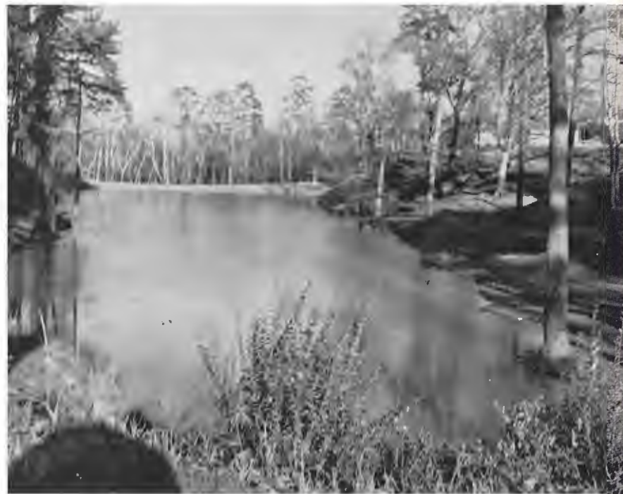
"I don't see no creature."