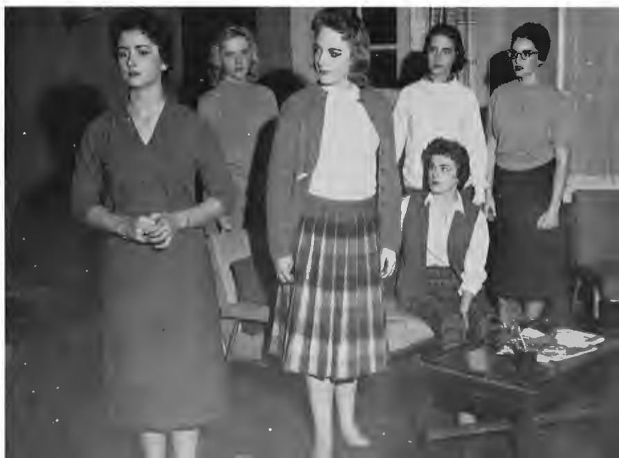
A tense moment in "Nine Girls."