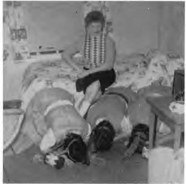
"Pray, pledges, pray."