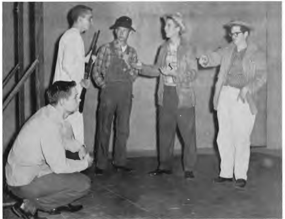
A moment of confusion in this scene from the student production comedy "No Time for Sergeants."