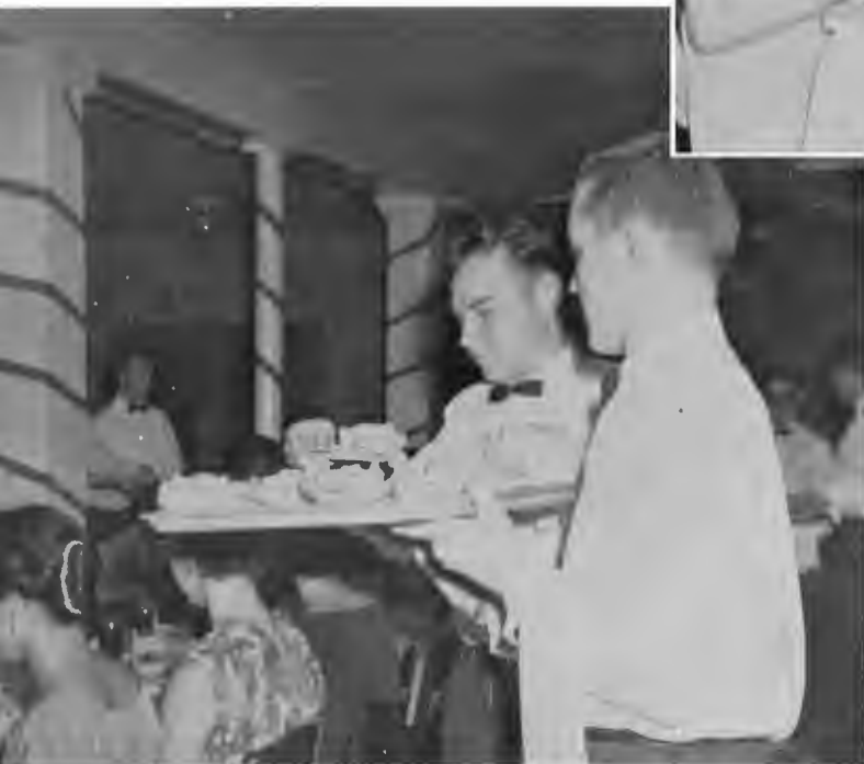
Professional food jugglers?