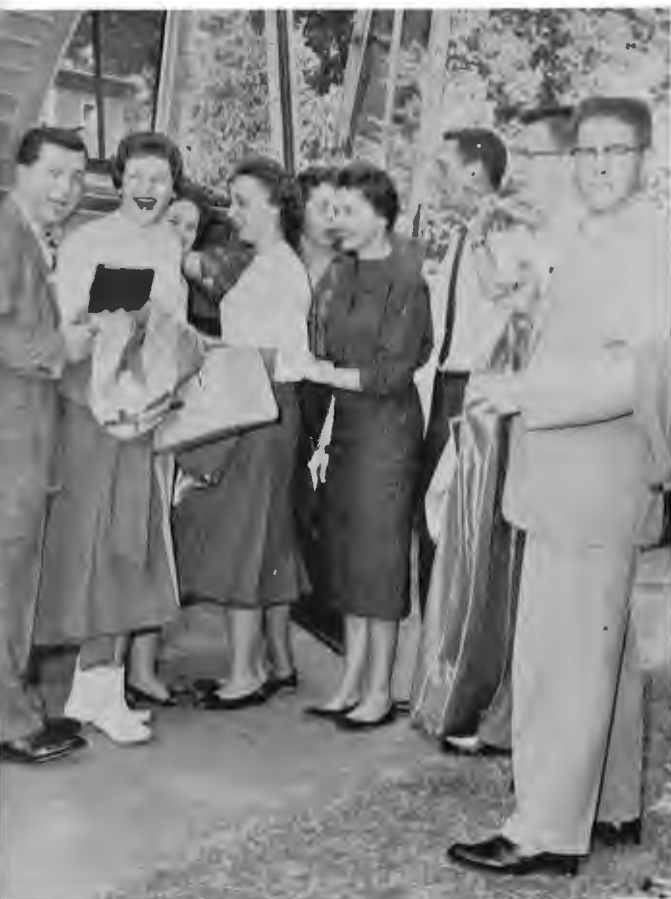
They move as slow as a herd of cattle, don't they, Charlie?