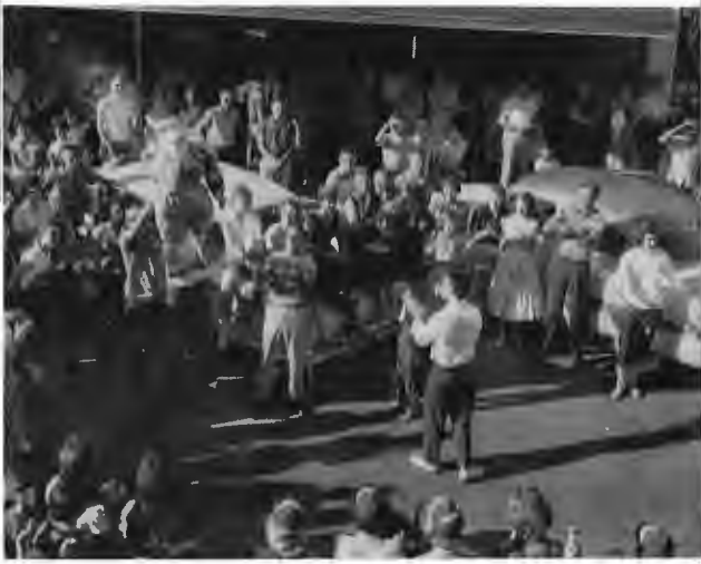
Boisterous example of that ole' Tiger spirit.