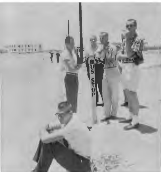
"Standing on the corner watching . . ."