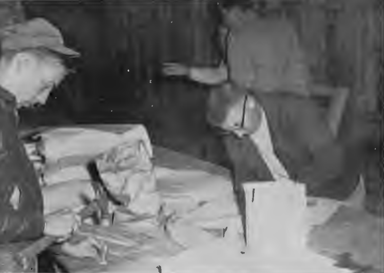
"Doggone these cheap nails. You better not bend this time."