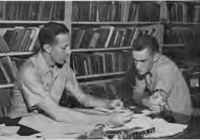
A word to the wise should be sufficient. The annual faculty reception where first impressions are made.