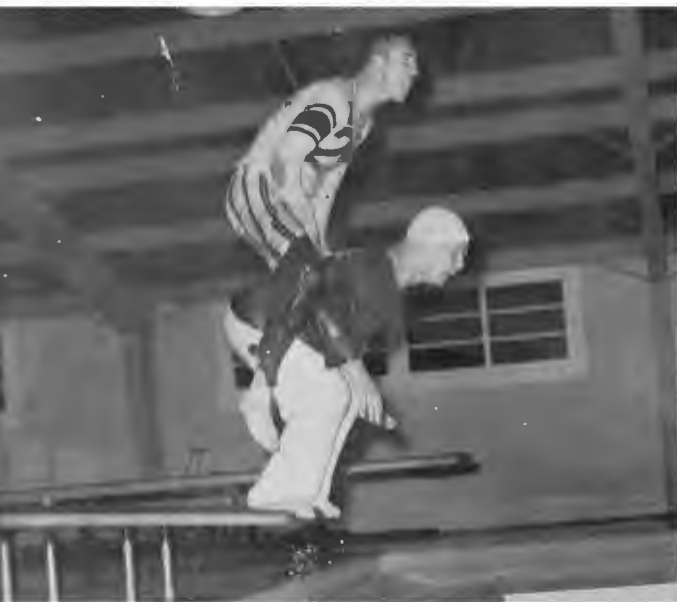
It must be the result of water on the brain.