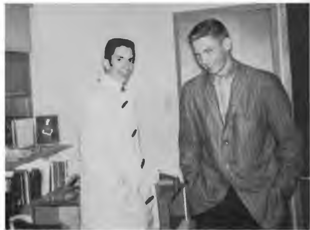
"Jim Dandies" to the rescue.