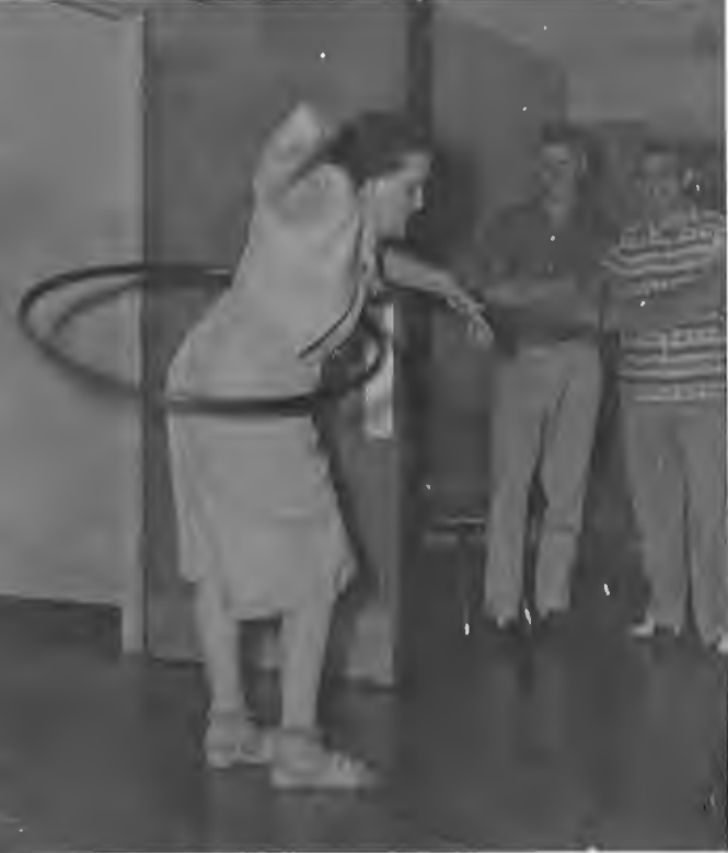
Round and round she goes and where she stops nobody knows.