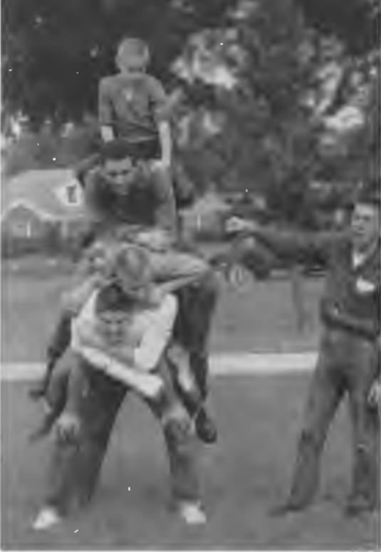
A one-act performance