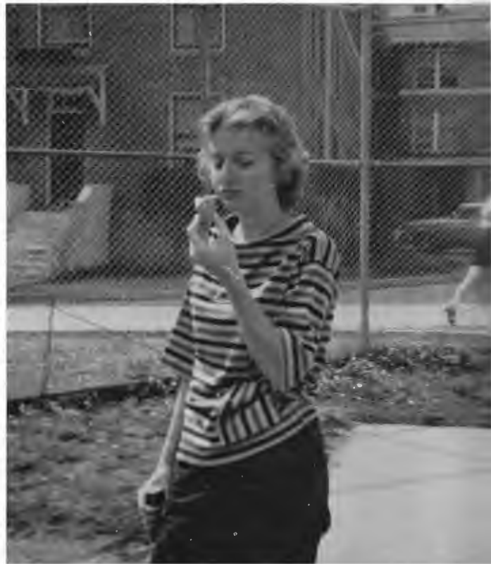
"Taste good like ice cream should."