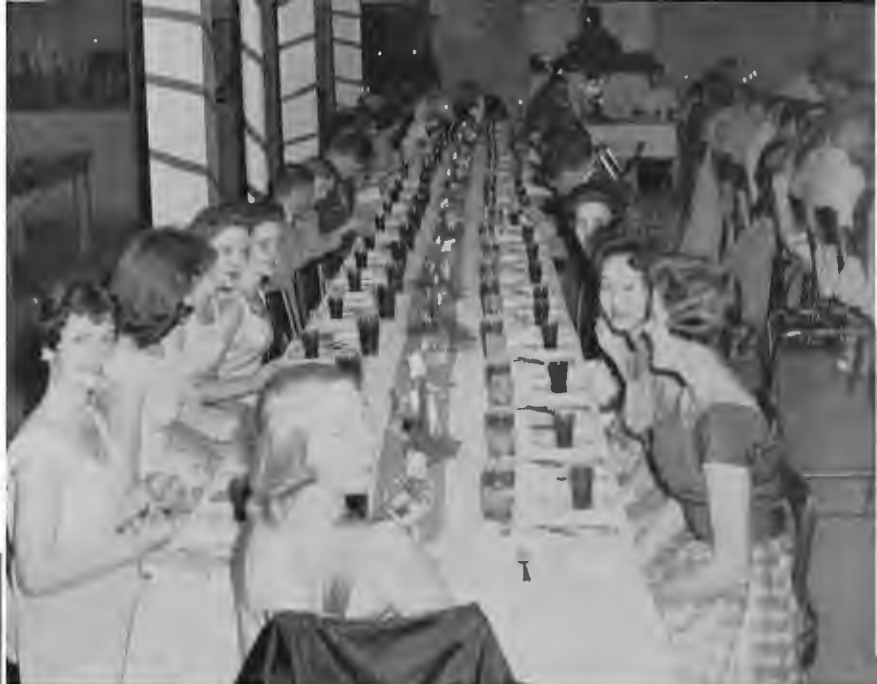
The tables were arrayed with Christmas decorations and pretty ladies.