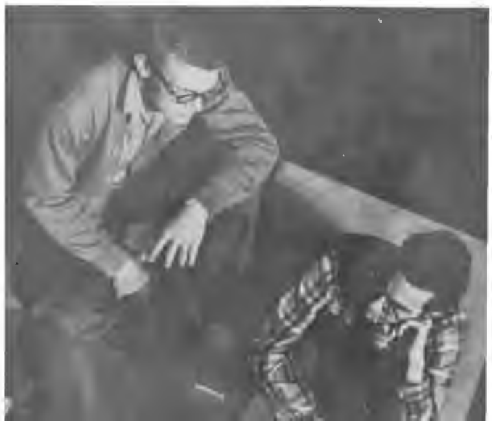
"Think we'll ever find a job?"