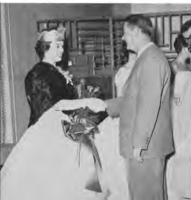
A favorite spot during the reception.