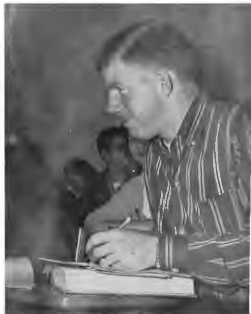
"Of course this means murder if I get caught."