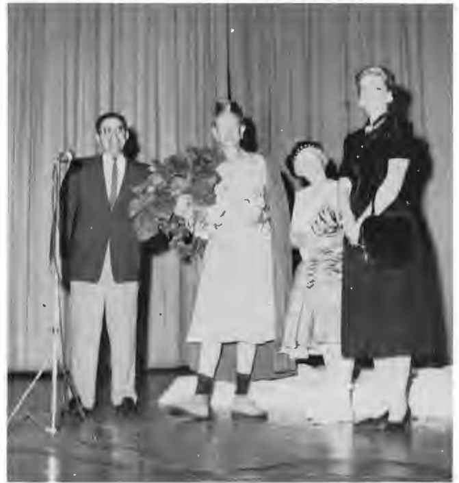
One of the few times in the year the faculty lets their hair down.