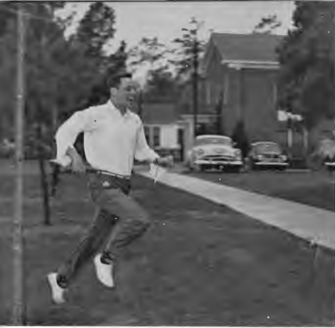
Dance, ballerina, dance.