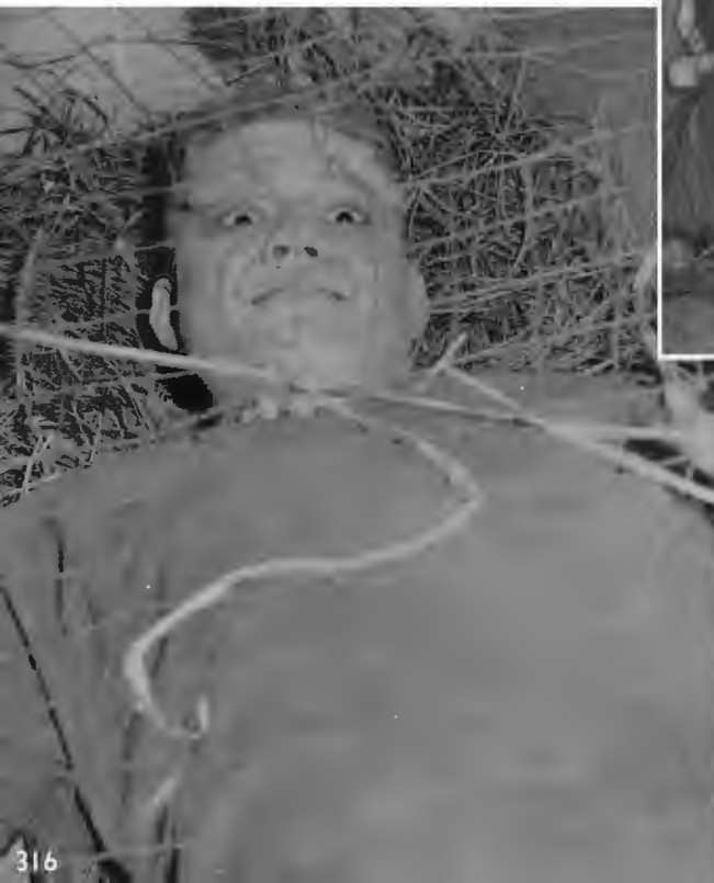
"Me, Tarzan—You Jane."