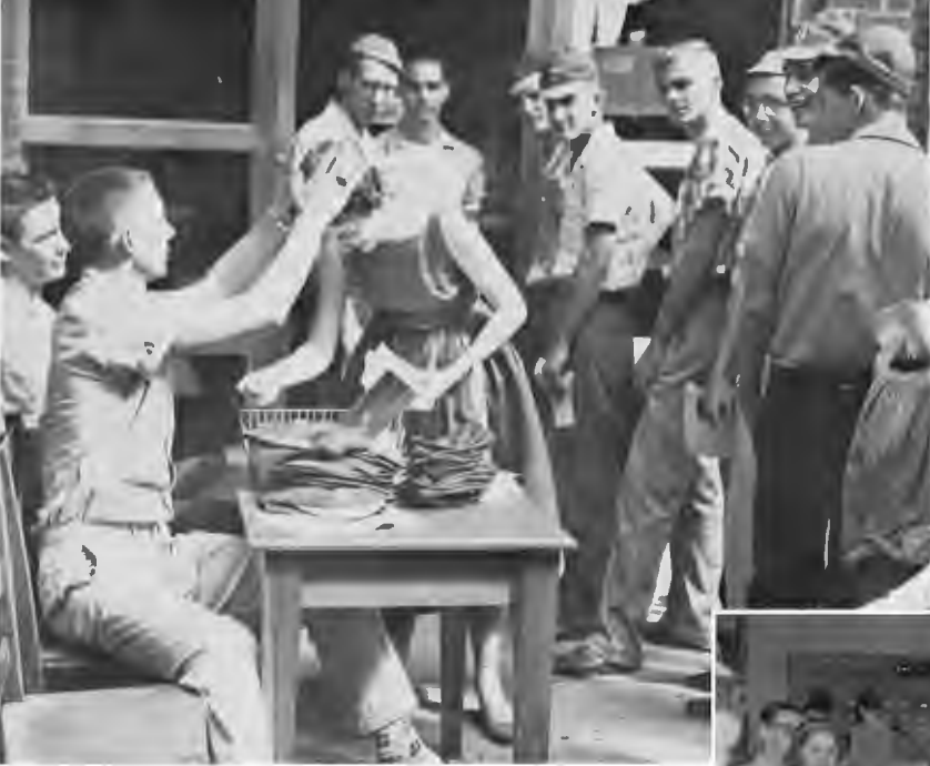
... And so began the "beanie brigade."