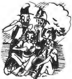
The jumping Jakes at their jazziest!