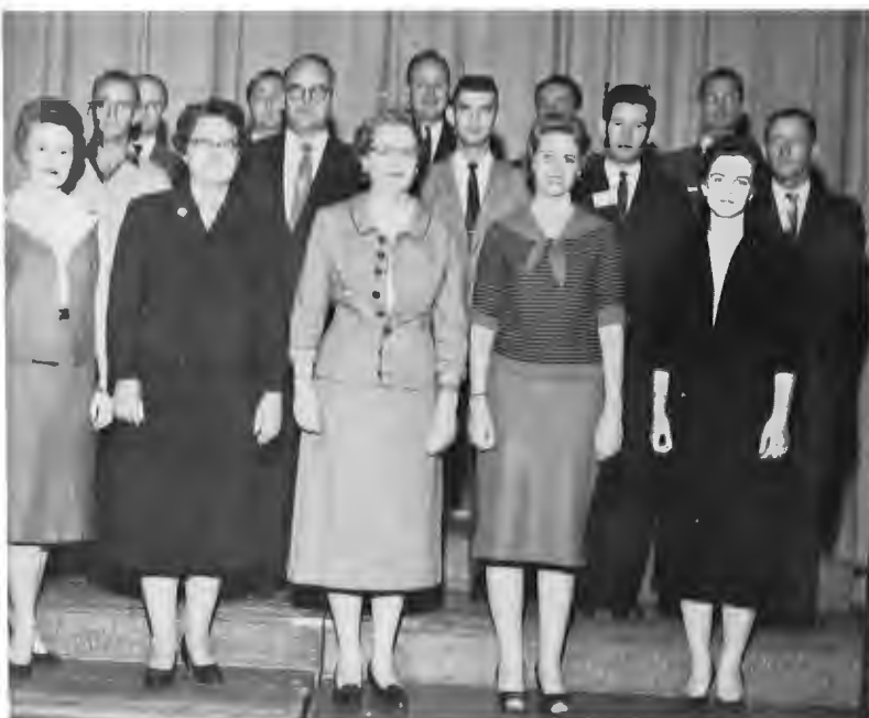
This was the team that helped to make the convention a success.