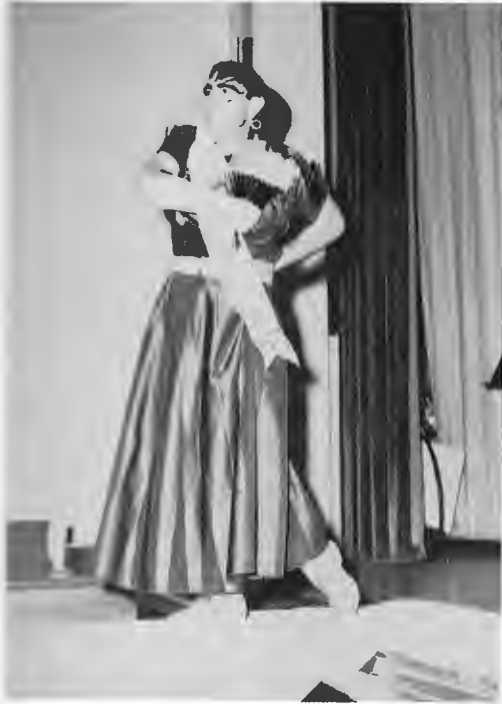
Presenting . . . Miss Calculate.