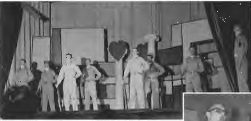
A fine performance came from the drill team.