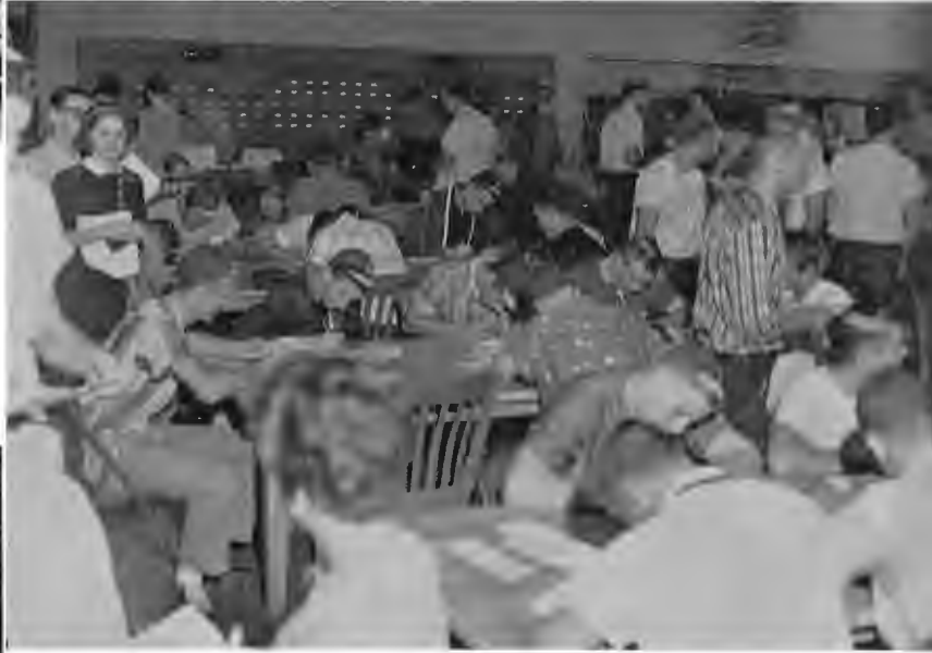
Registration—where many a headache begins and ends.