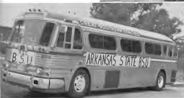
Arkansas State B.S.U. turned out in full force.