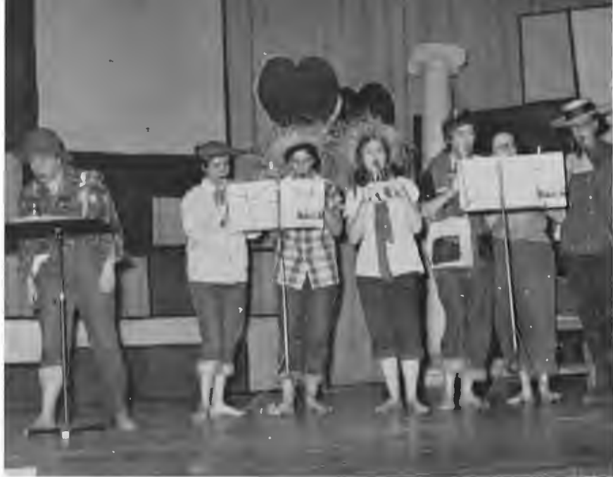
That's the Bottle Band, puffin' and blowin' and beatin' out mean rhythm.