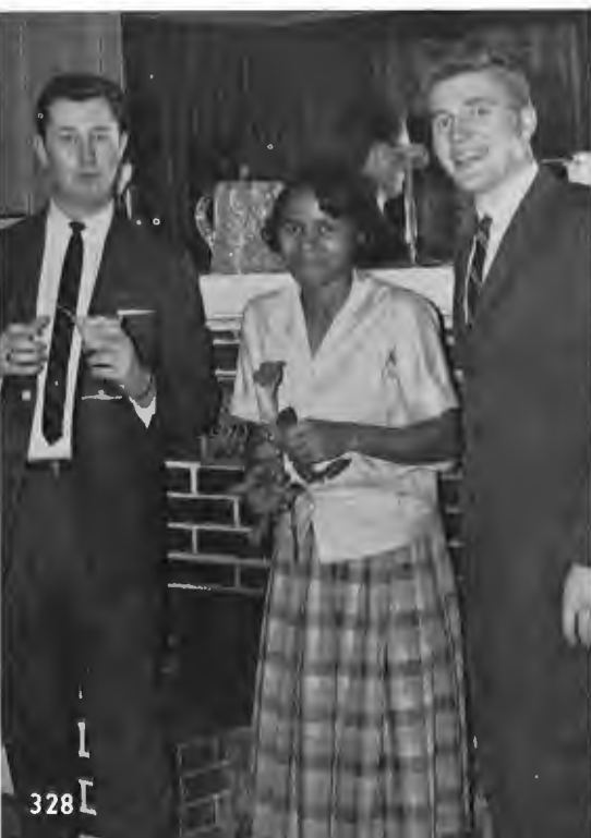
If she can stand 'em, she deserves a flower.