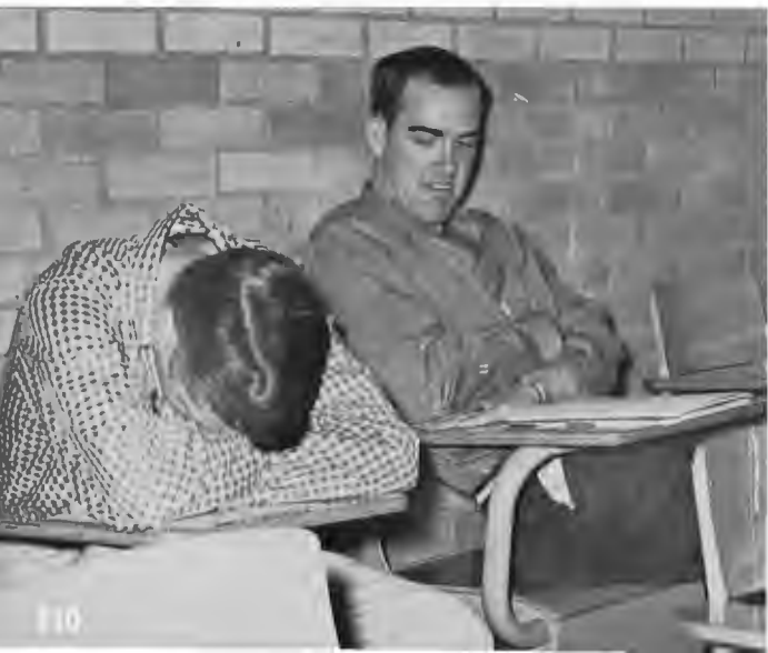
"Aw, don't take it so hard, there were only 500 questions."