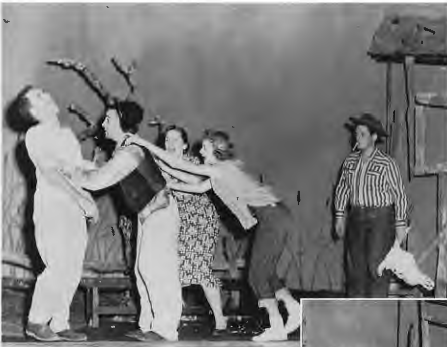
Never a dull moment in the Summer Theater production of "The Great Big Doorstep."