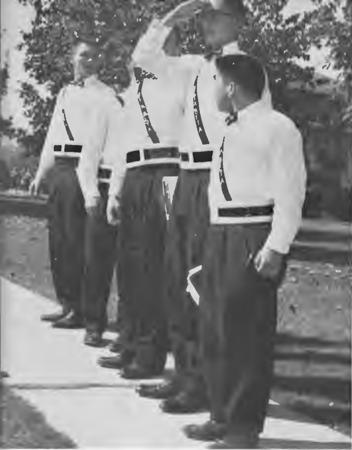
"See any members!!"