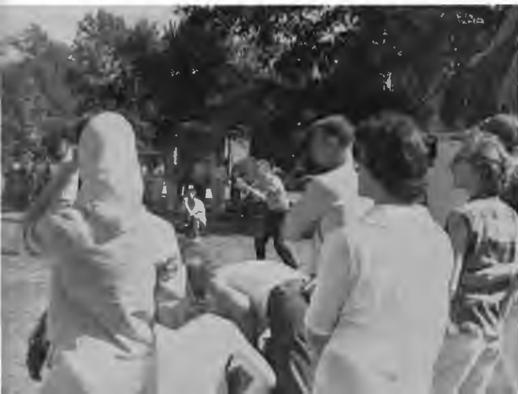
Memories of Freshman-Sophomore Day—and remember who won!