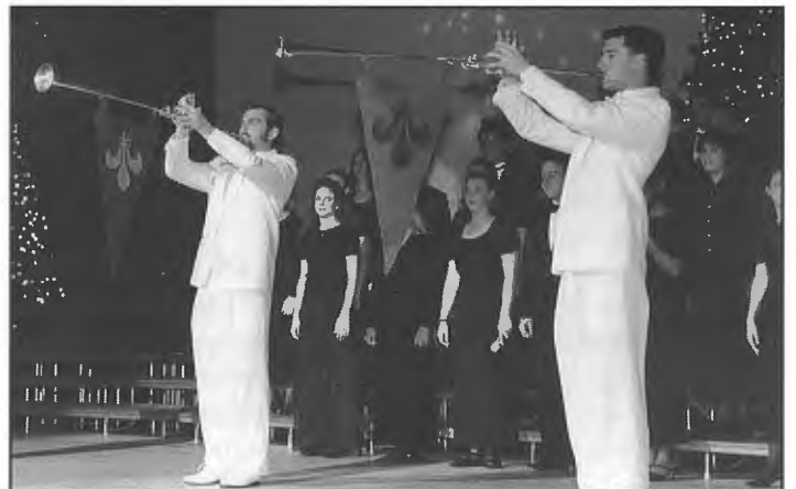
CHRISTMAS SPIRIT • The seventh annual Festival of Christmas celebration was held on December 3, 4 & 5, sponsored by the Division of Music of the Bernice Young Jones School of Fine Arts. The program included religious and secular Christmas musical favorites, intertwined with holiday theme interpretations through drama. The program included more than 250 students with performances by the Ouachita Concert Choir, Ouachita Singers, Ouachita Sounds, Ouachita Praise Singers, Ouachita Handbell Ringers, Ouachita Drama Team, the Ouachita Wind Ensemble.

Among other advantages, creating a charitable remainder trust gives you an income tax deduction, which results in tax savings.