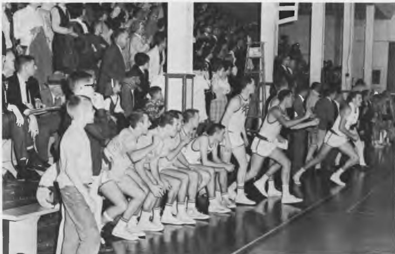
The Tiger bench is in a state of jubilation after a wild, uphill 87-84 win over Hendrix at Bill Walton gym.

Ouachita met Emporia State Teachers, the sixth seeded team in the national tournament, and lost by a score of 93-68.