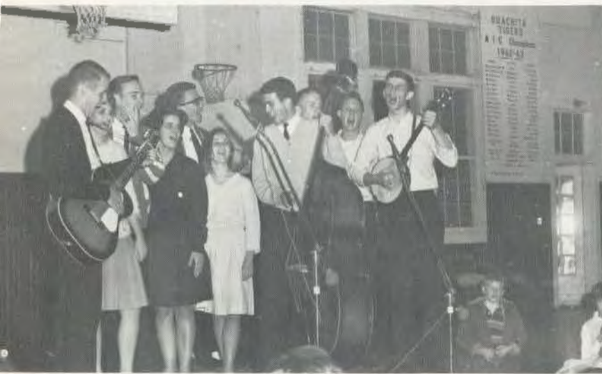
Excitement of Ouachita's victory over Henderson continued after the game at the Hootanany sponsored by the Junior Class. Here, the Watchmen and the Hannaberry Singers combine efforts.