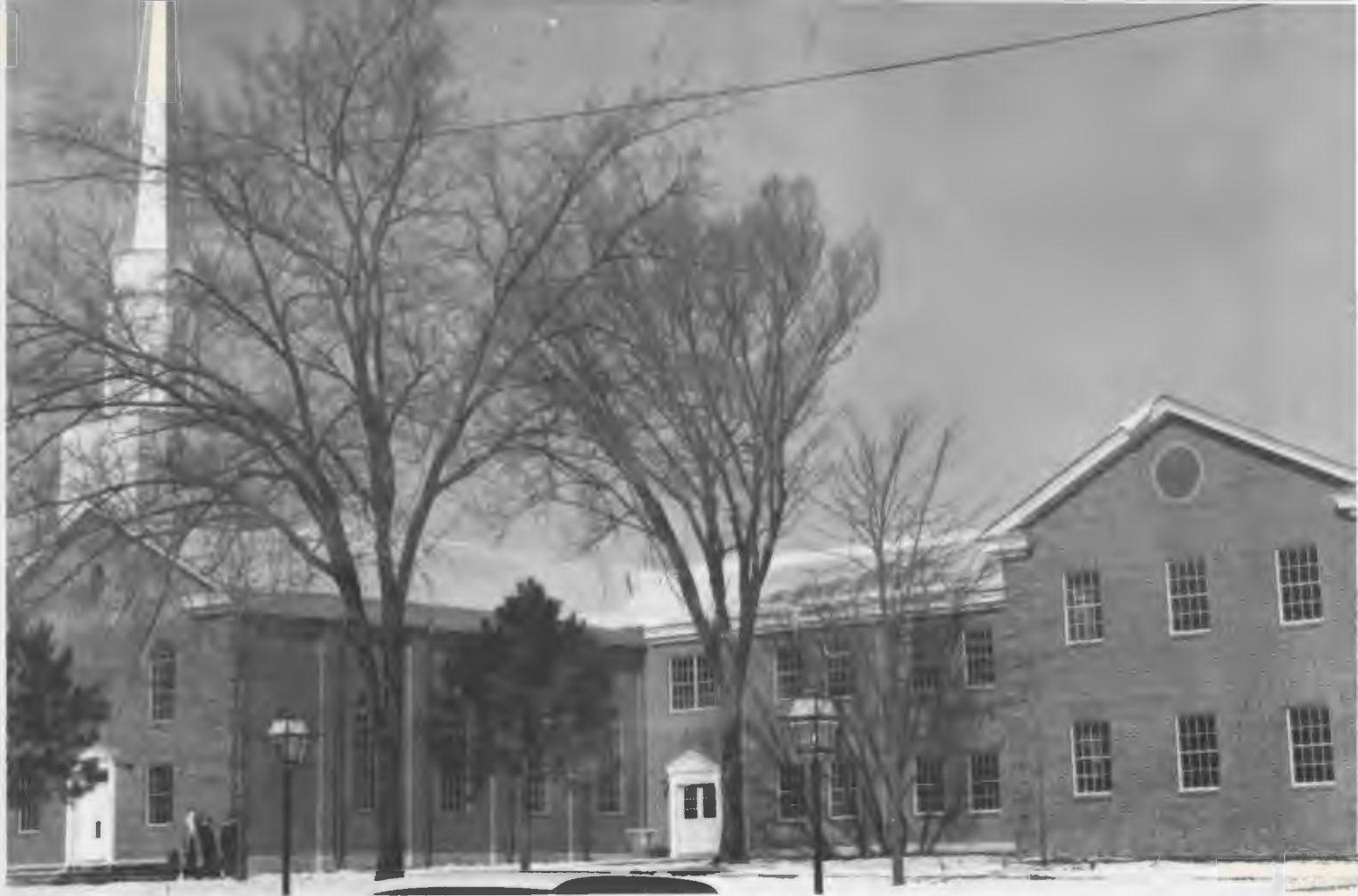
Berry Bible Building houses the Division of Religion and Philosophy. In addition to division offices and classrooms it has a beautiful chapel at left and tower with a bell carrilon.