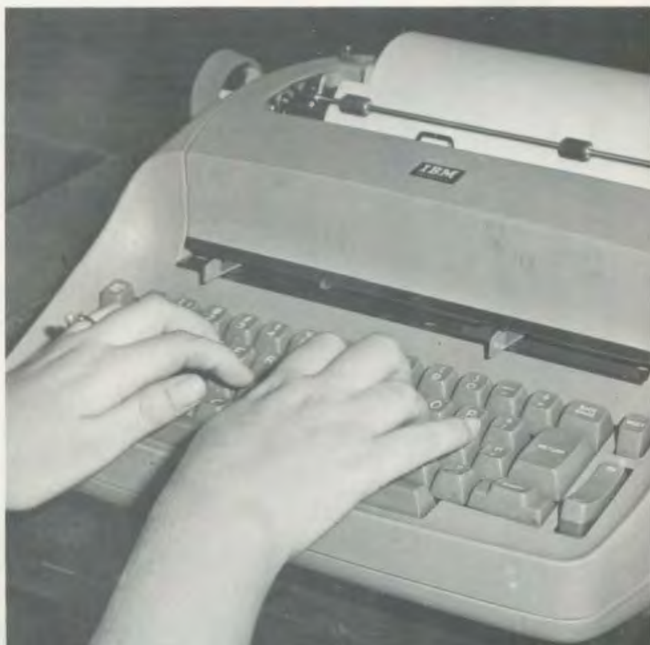
Student practices on typewriter, one of the pieces of equipment available for their use in the Business Department.