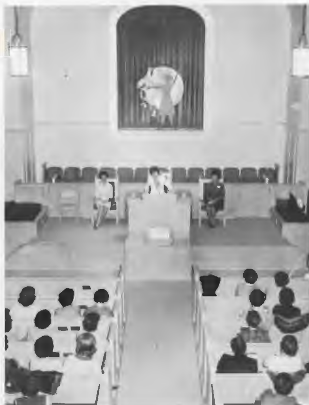
Interior of the beautiful Berry Bible Building. The Chapel is used for devotionals during conferences, and many students and former students are married here.