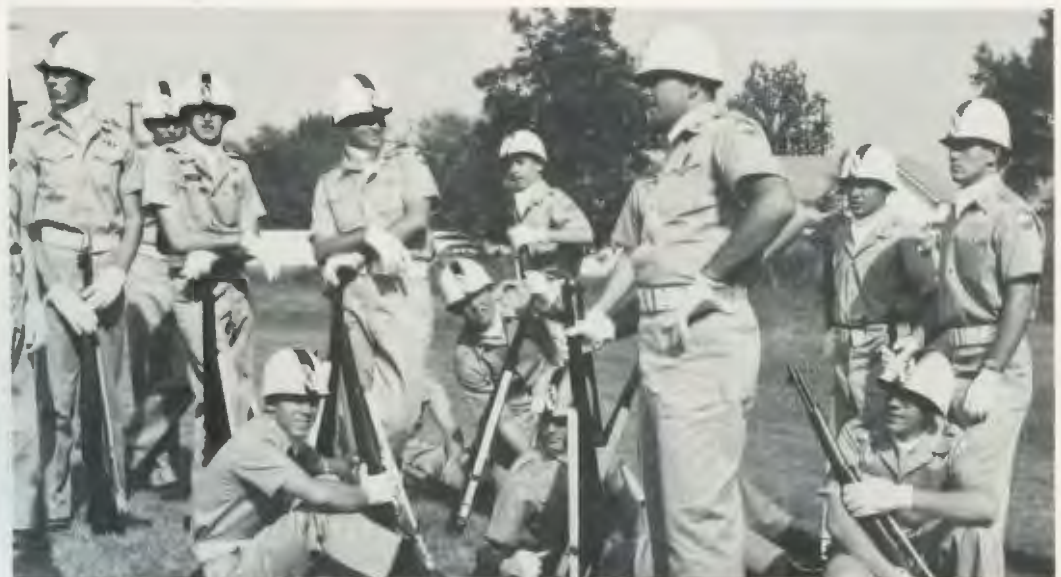
Taking a "breather," the Drill Team rests for a moment during an afternoon of heavy marching on the old football field.