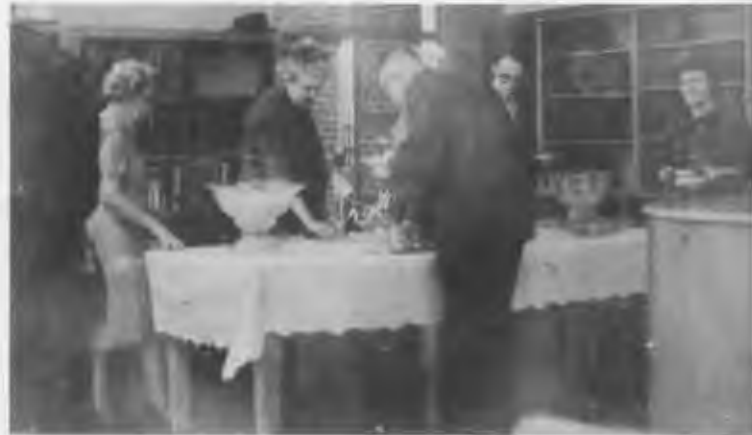
Trustees and faculty members take a break from the meeting and help themselves to refreshments at a tea in Riley Library.

The students do not always fully realize exactly how the members of the board strive constantly toward improvement and enlargement for Ouachita Baptist College.