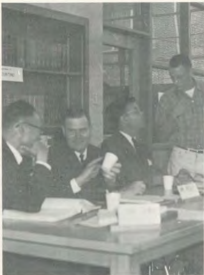
Student gets help during registration from faculty-members in Business and Economic Department.