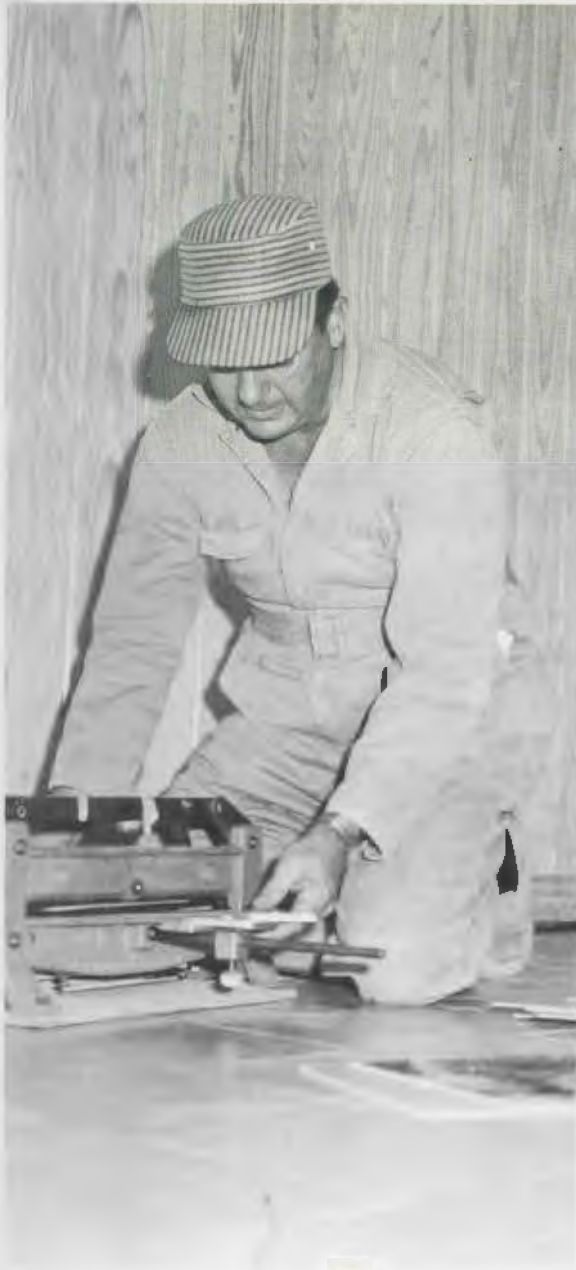
Trimming tile to fit the floor, the president pitches in to help so that the student center annex will be completed by Homecoming.

His fatherly attitude toward Ouachita has led us through some trying and sober moments this year, making Ouachitonians feel as if they were part of one great big family.