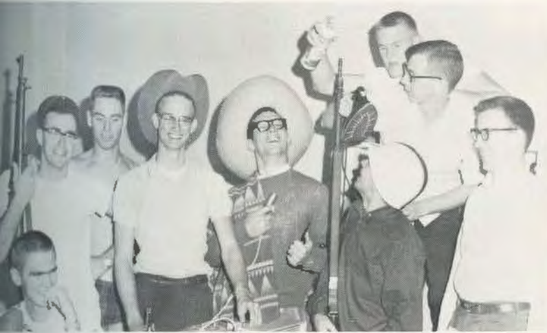
"After the invasion," the boys of North Dorm demonstrate the trouble they will go to for a little fun and the hilarity often involved.

Learning the real meaning of service, Delta Kappa Delta Social Club sponsors a Christmas benefit for the Children's Colony in Conway. Some of the children are even participating in the show.