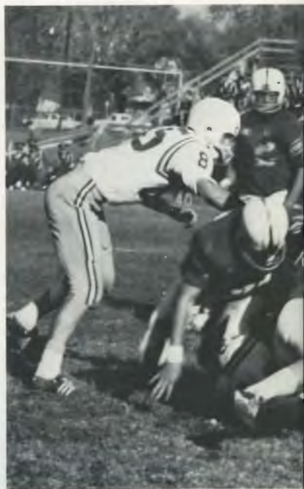
Our students take part in one of the most strenuous of sports — football.