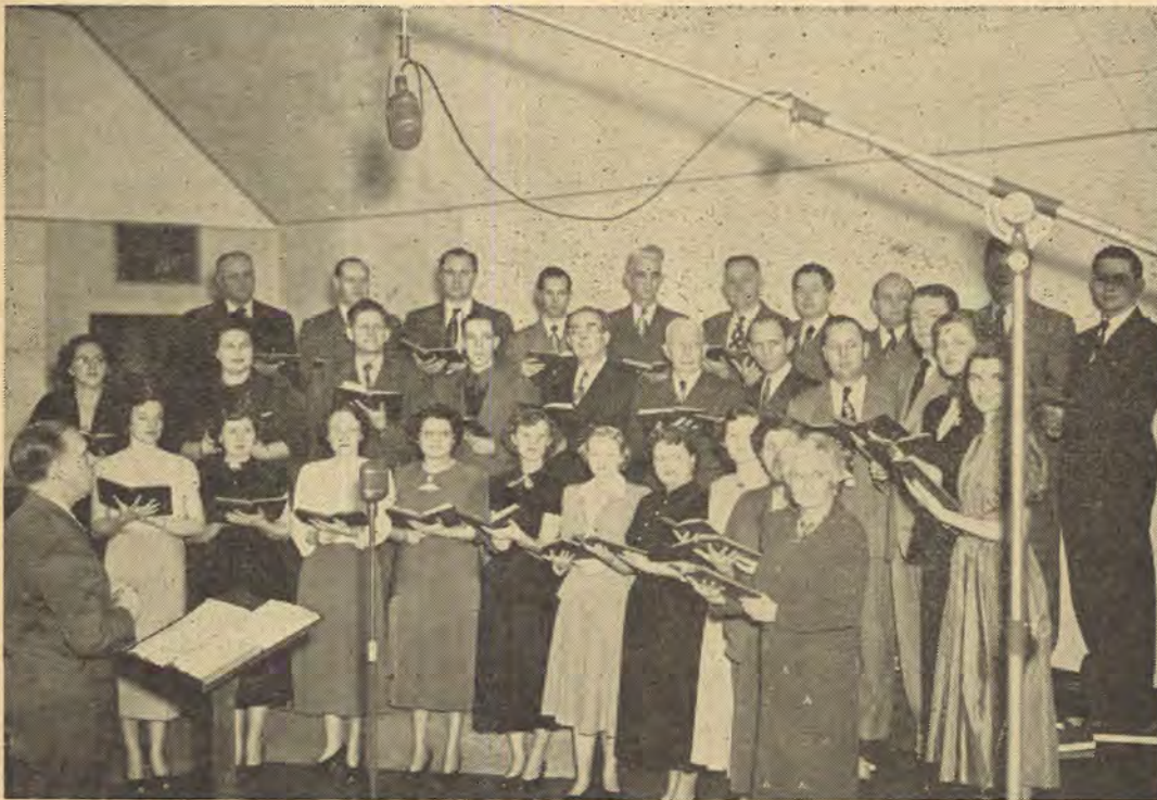
Heard on 229 stations. Most outlets arranged at no cost to the Radio Commission.