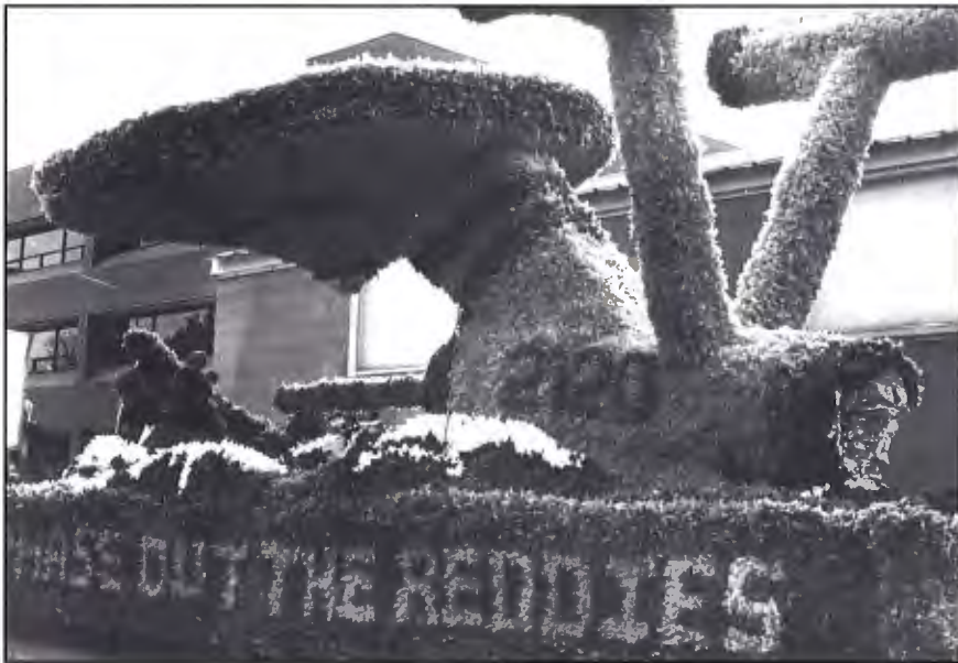
BATTLE OF THE RAVINE · "Phase out the Reddies" was the theme of this 1970s homecoming float.