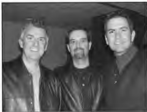
GRAND PRIZE • (top) The EEEs perform their winning show during Tiger Tunes.