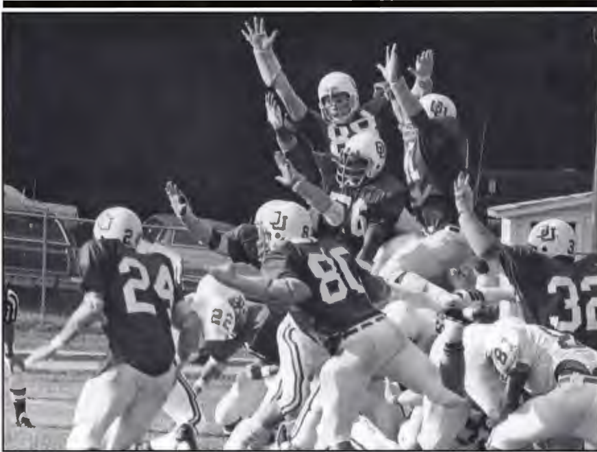
TIGER FOOTBALL • (1970s) The Ouachita special teams unit attempts to block a field goal at A.U. Williams Field.