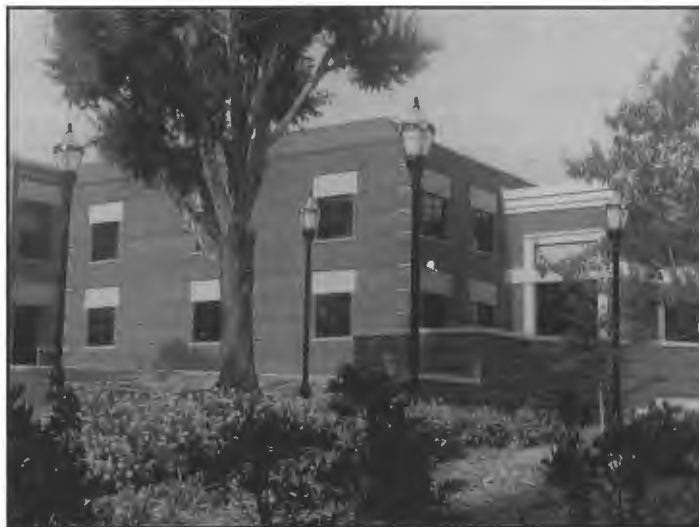
LIGHTPOSTS • New lightposts were installed on campus this summer. The decorative globes include the Ouachita book and flame.

As with any investment decision, please consult with your professional advisors before proceeding.