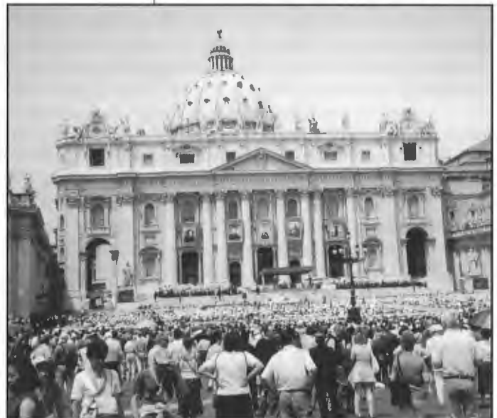
Joining tens of thousands of other worshippers on Sunday morning in St. Peter's square, the students witness Pope John Paul presiding over the canonization of five new saints.