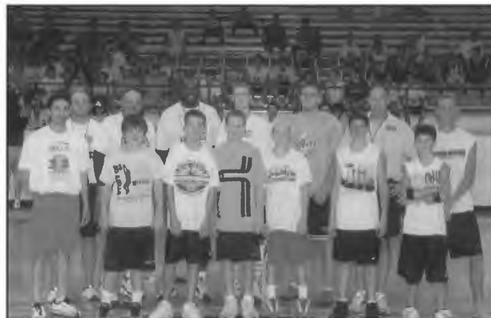
SUMMER CAMP • Ouachita coaches, players, former players, and children of alumni are pictured at the OBU Tiger Basketball Camp. Over 7,300 campers attended 23 events held on campus this summer.