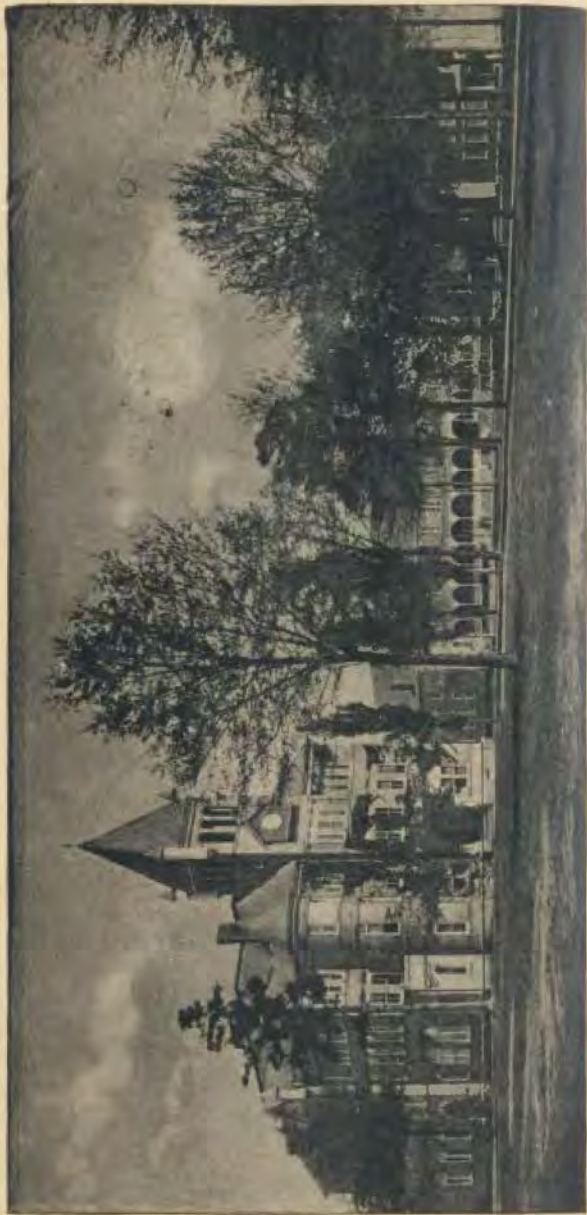
OUACHITA COLLEGE, ARKADELPHIA, ARK.