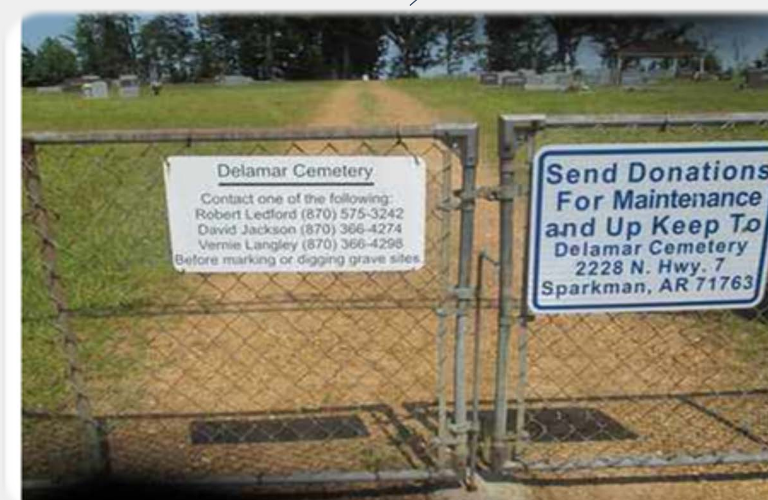
DeLamar Cemetery 1875