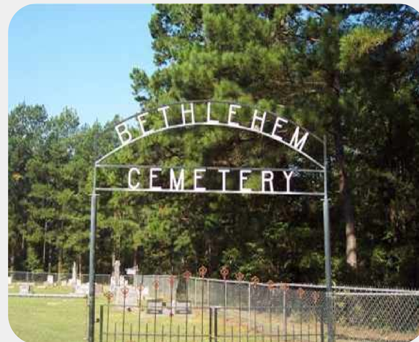
Bethlehem Cemetery 1848 "Bethlehem Cemetery is located in Joan, AR, near the intersection of AR Highways 128 and 51 on the east side of the Ouachita River from Arkadelphia."