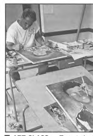
■ ART CLASS — Two students assignments for a painting class i Fine Arts Center studio.