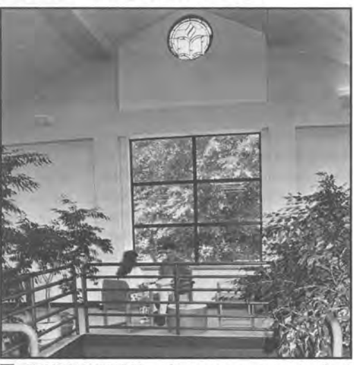
■ STUDY BREAK — Students prepare for final exams this spring on the second floor of Riley-Hickingbotham Library.