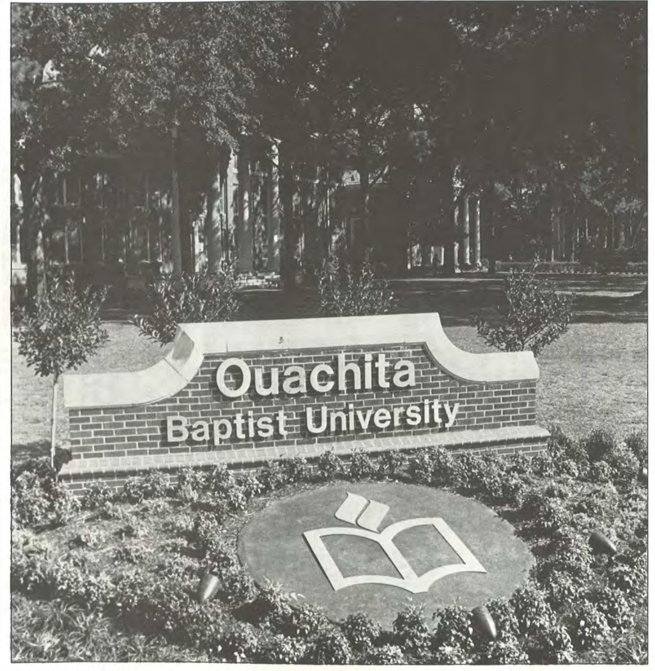
■ CAMPUS ENTRANCE — Campus visitors are now greeted by entrance signs made possible by a gift from the Roy and Christine Sturgis Charitable and Educational Trust of Malvern. The main sign, which features the Ouachita logo, is on the corner in front of Cone-Bottoms dormitory.