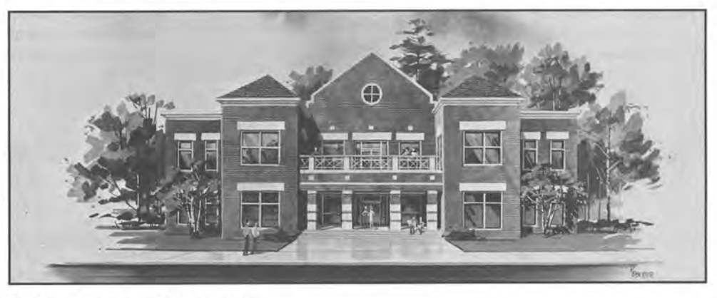
■ New Administration Building