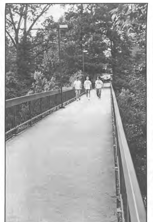
■ SPRING STROLL-- Three students use the pedestrian bridge that connects the north campus with the main campus at Ouachita. The bridge was constructed in 1975 by the Mabee Foundation.