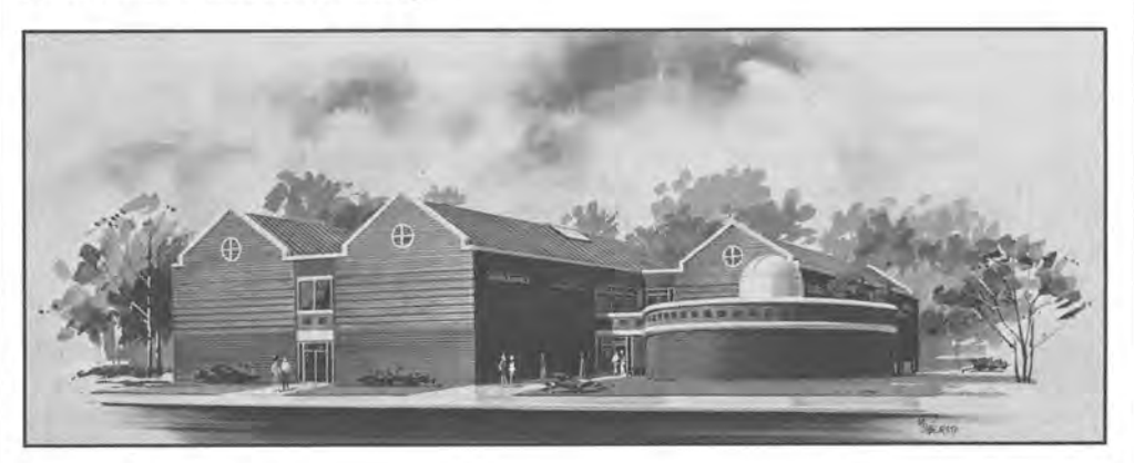
■ New Science Building