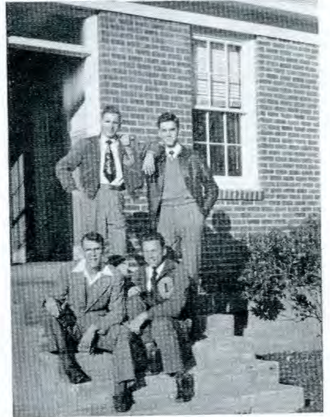
Mitchell Hall, music conservatory, is the scene of all the concerts and now offices the Registrar and Dean. Many of the classes are meeting temporarily in the music conservatory.