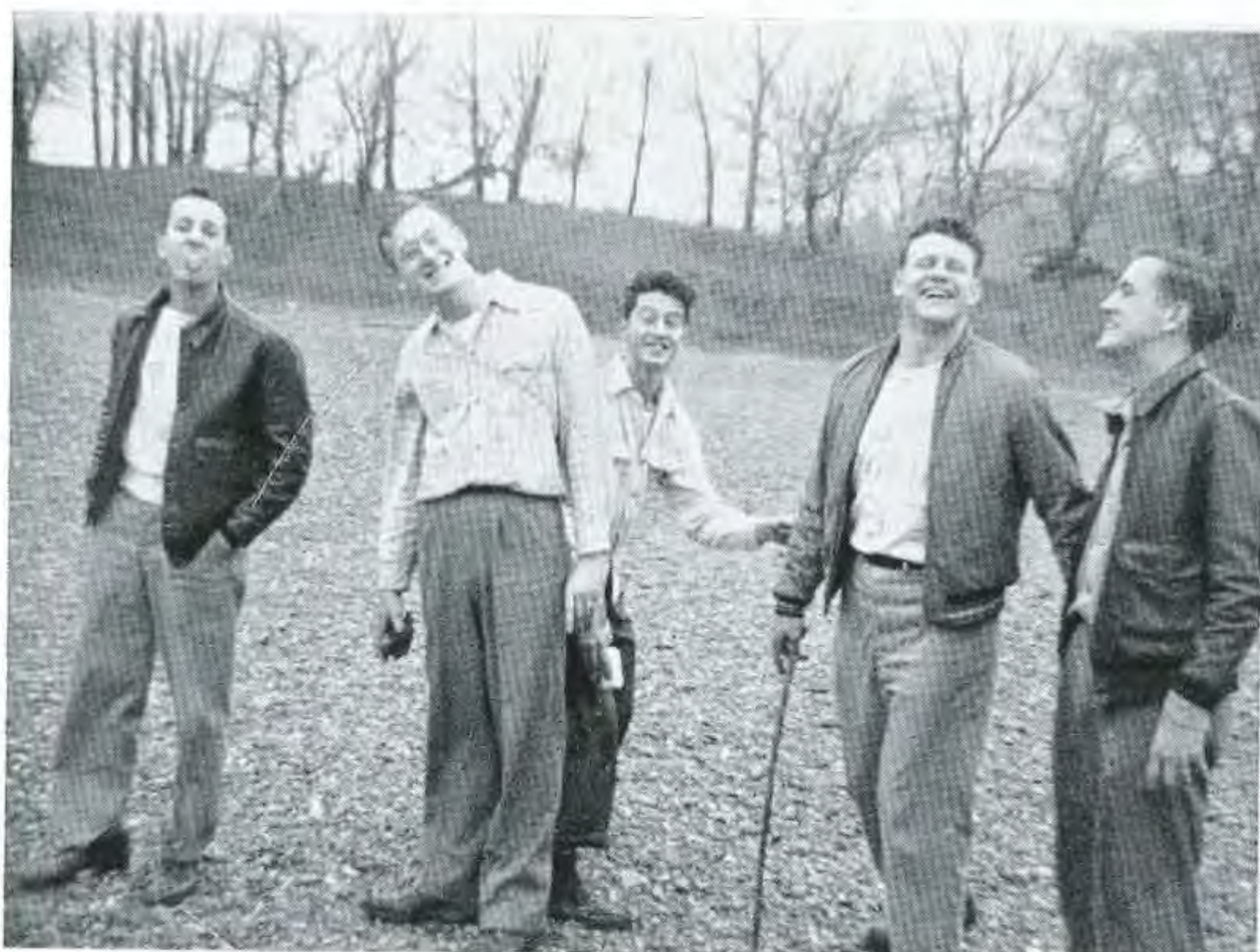
We went to the river