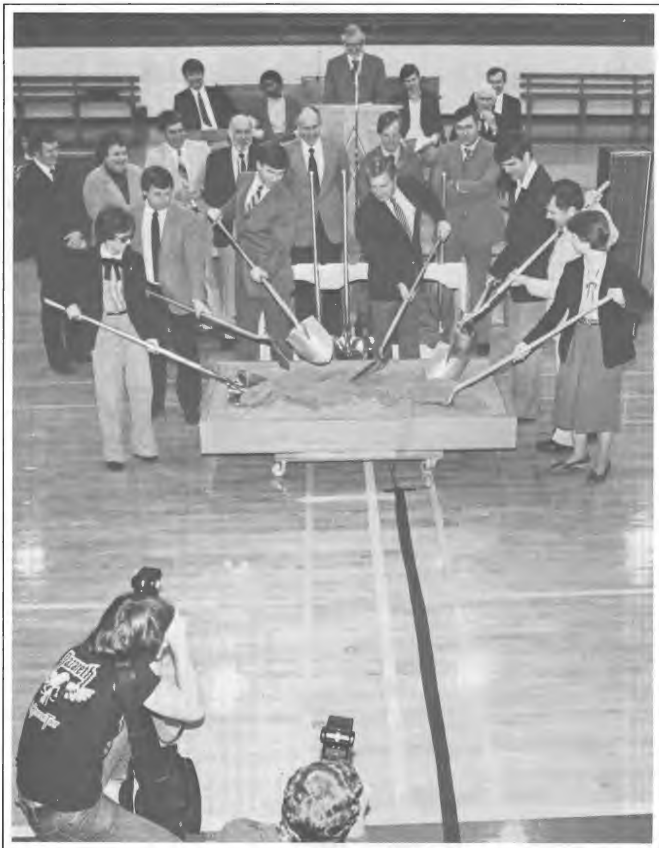
Members of the Ouachita coaching staff participate in ground-breaking ceremonies for the $4 million health, physical education and

OUACHITA BAPTIST UNIVERSITY • ARKADELPHIA, AR • MARCH 1982