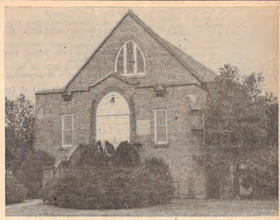
AUDITORIUM dedicated by Tyronza Baptists on Sunday, Jan. 19.

LITTLE GIANT MFG. CO. 907 7th Street, Orange, Texas