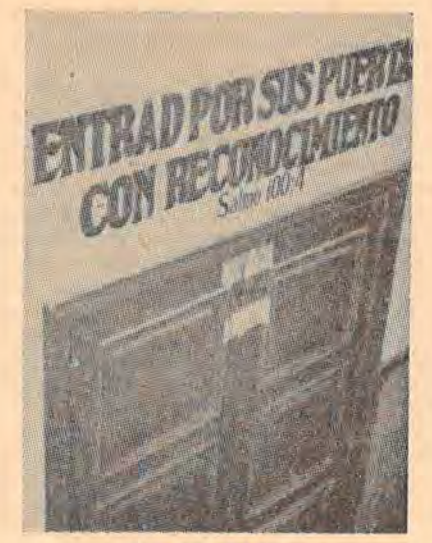
The Closed Door

Perhaps the authorities no longer cared about the whole matter? Why not begin services again? And so they did.