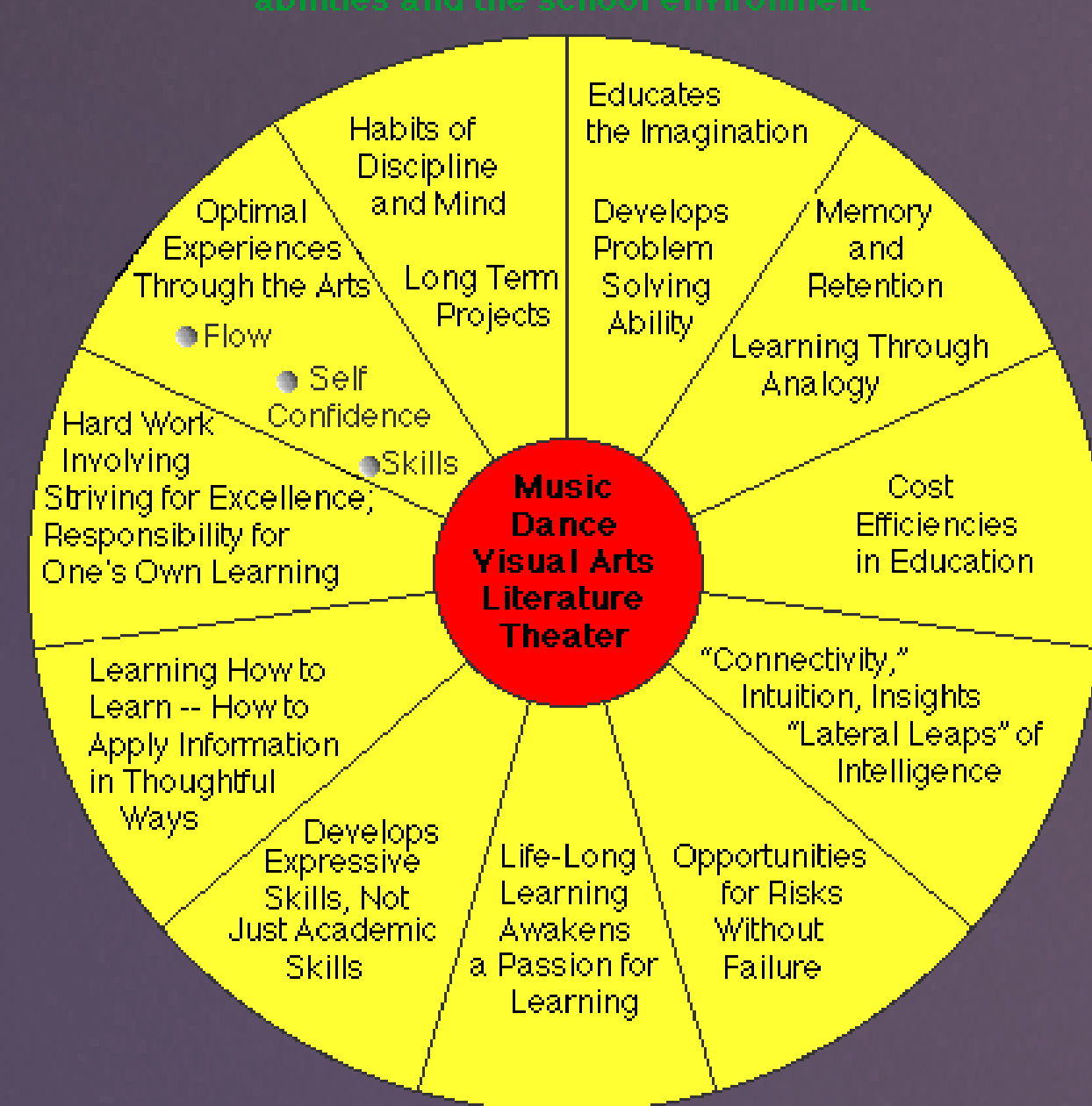
Wheel of Arts Integration Benefits