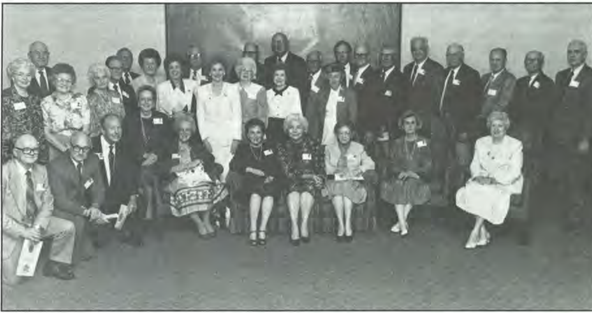
■ GOLD TIGERS — Members of the Class of 1940 gathered in May for their 50th reunion. The Gold Tigers came from as far away as Riverside, Calif.