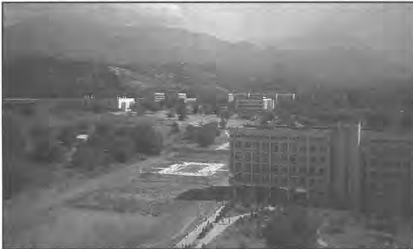
■ Kazakh State University in Alma Ata.