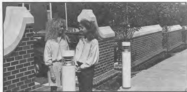
new parking area was built on the site of Terral-Moore and Johnson halls. The project also includes new entrance signs for the University.