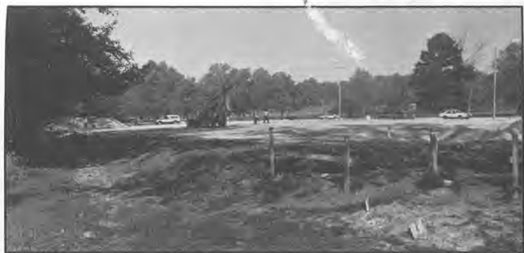
■ The four-court tennis center (left) under construction on the North Campus. A colonial-style brick wall (right) with landscaped planters borders Sixth Street. A

The new auditorium, he said, will be the first of "three or four" major construction projects planned during the next 10 years.