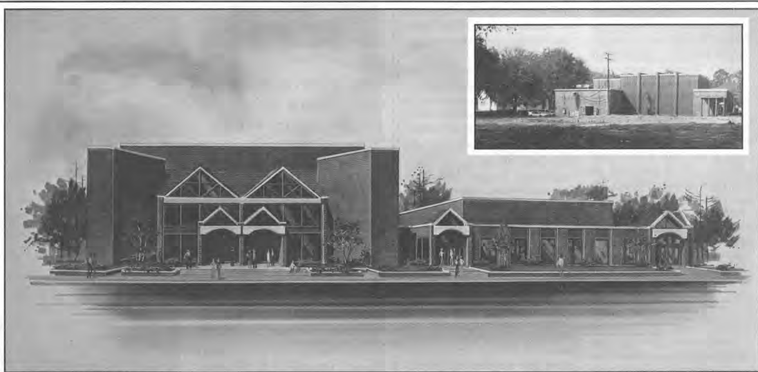
■ Architect's drawing of the new $5 million auditorium to be built next to Verser Drama Center (inset), which will also be given a new look. Construction is to be completed by the summer of 1992.

■ The World of Ouachita : International studies program continues to expand. Pages 6-7.