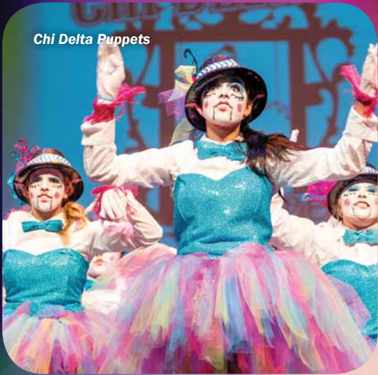
Chi Delta Puppets