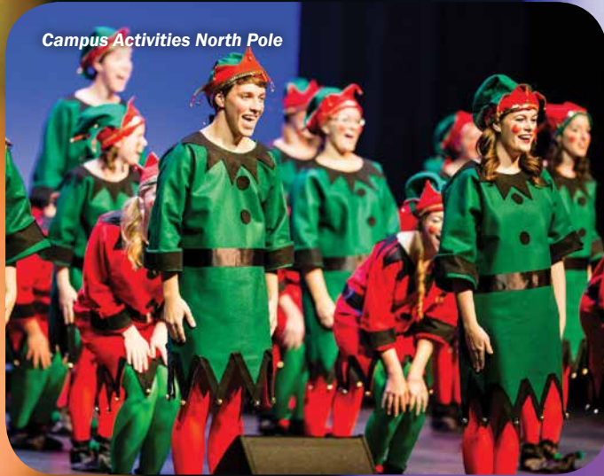
Campus Activities North Pole