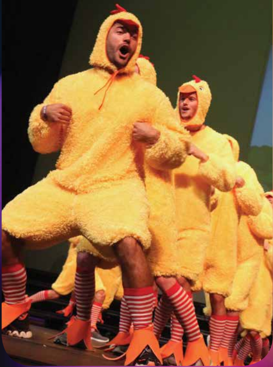
Beta Beta Chickens