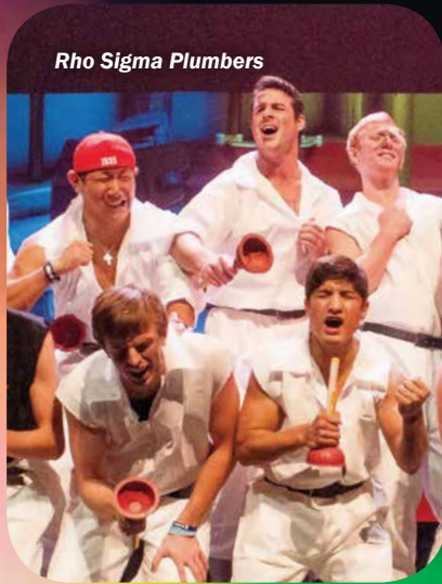
Rho Sigma Plumbers