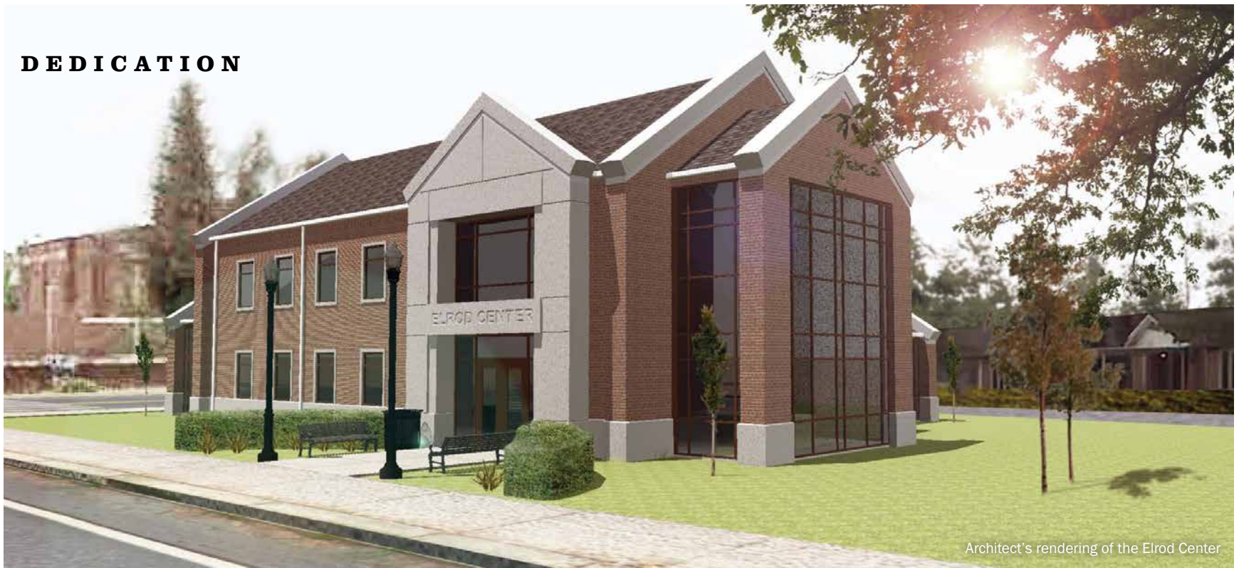
Architect's rendering of the Elrod Center