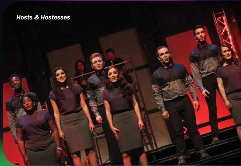
Hosts & Hostesses