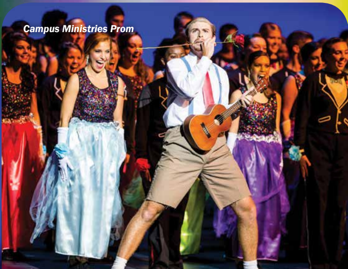
Campus Ministries Prom