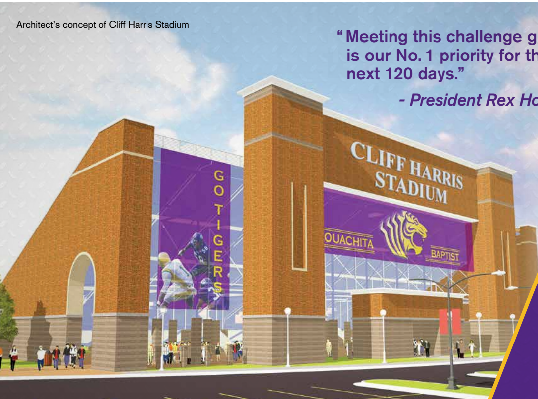
Architect's concept of Cliff Harris Stadium

“Meeting this challenge grant is our No. 1 priority for the next 120 days.”