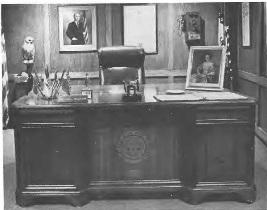
McCLELLAN DISPLAY —The late senator's office, recreated in McClellan Hall, includes his desk and chair from the Little Rock office, a portrait of his wife and other memorabilia including one of the owls in the collection he started after being tagged with the nickname of "wise old owl."

OUACHITA BAPTIST UNIVERSITY ALUMNI BULLETIN • ARKADDELPHIA, ARK. • AUGUST 1978 • VOL. CVII, NO. 3