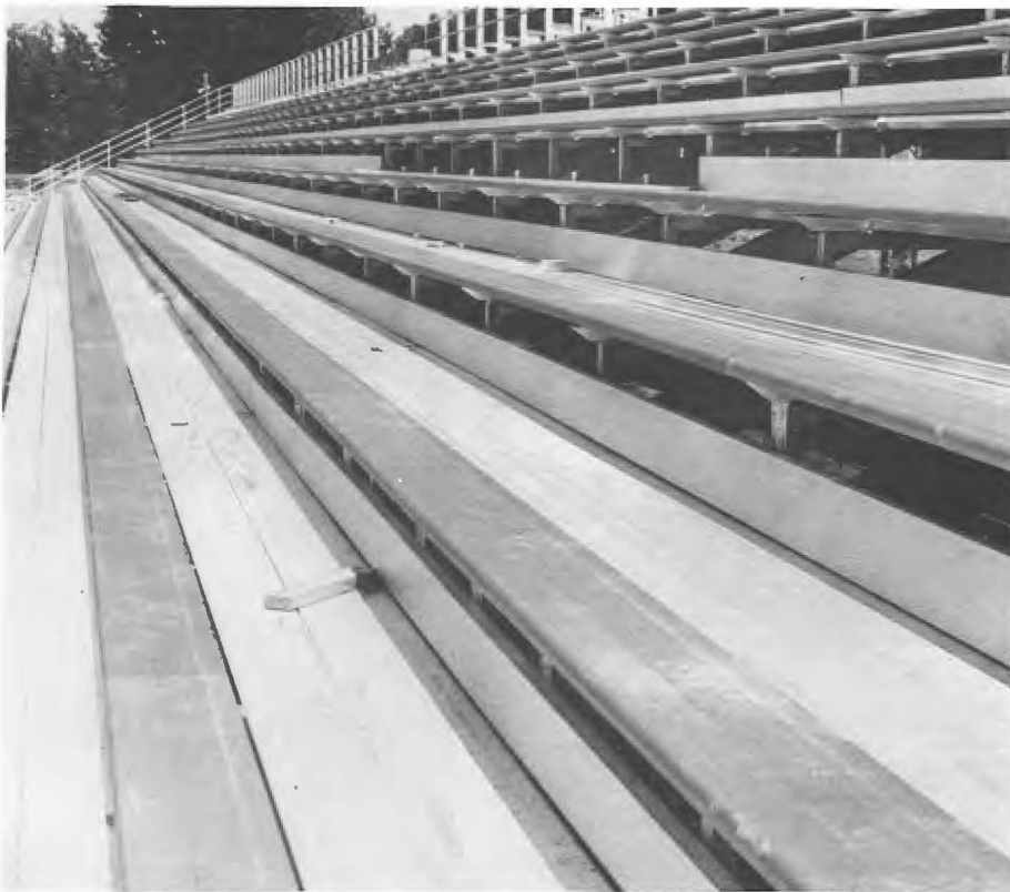
BLEACHER RENOVATION —Installation of aluminum seating at A.U. Williams Field has increased stadium capacity to 5,500, with an additional 16-row section provided between the 30-yard lines on the home side. The new section will have bench-type backs and will be used for reserve seats. A new pressbox and concession stand are also being constructed. Work on the stadium is expected to be completed in time for Ouachita's opener Sept. 9 against Bishop College.

Star City, Ar. and the Halbert parents pause now and then to wonder how it happened they produced three world citizens within one family in one small town.