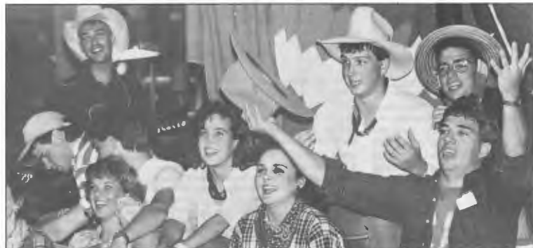
Students whoop it up during Sadie Hawkins Day this fall.