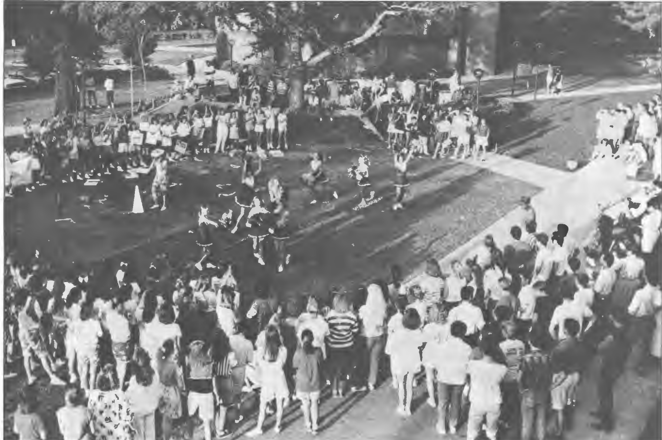
■ An early-autumn pep rally gathers momentum in front of McClellan Hall.

Mrs. Mary Elizabeth Ziegler Mr. Zig Ziegler