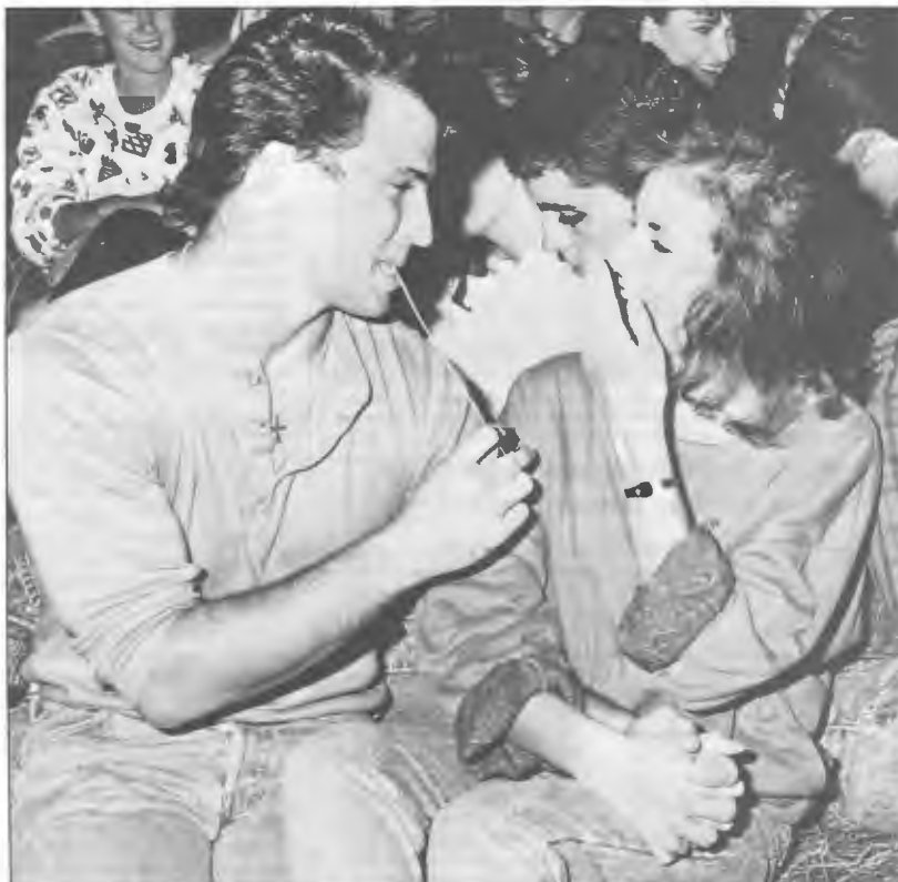
Two students (above) enjoy each other's company during Sadie Hawkins Day earlier this fall. Members of the Gamma Phi social club (below) express their support during a pep rally.