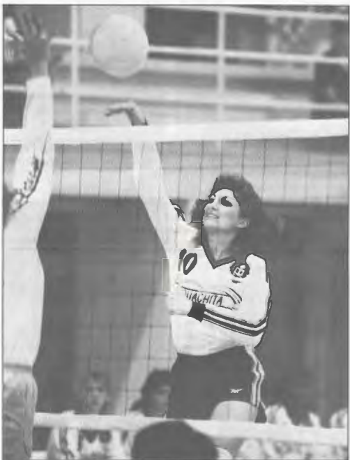
■ A Ouachita player spikes the volleyball during a recent match.