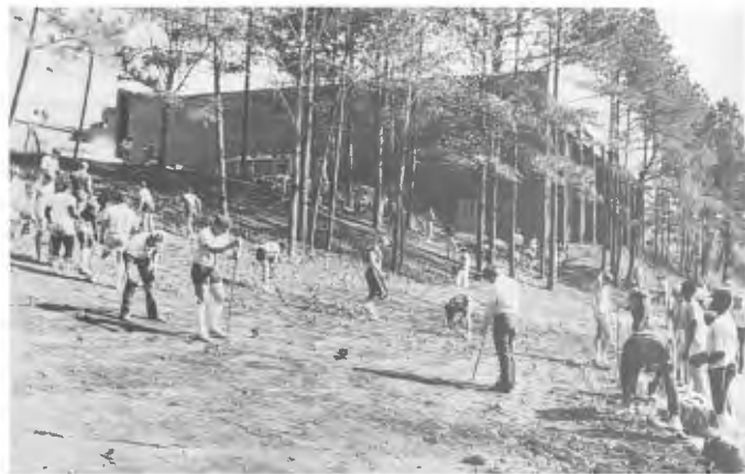
Members of Ouachita's social clubs and other students (above) assist the maintenance crew in planting groundcover alongside the new $4 million physical education center.

Strengthening the endowment and thus making it possible to enhance Onachita's academic program is a hig priority in the Centennial Campaign effort.