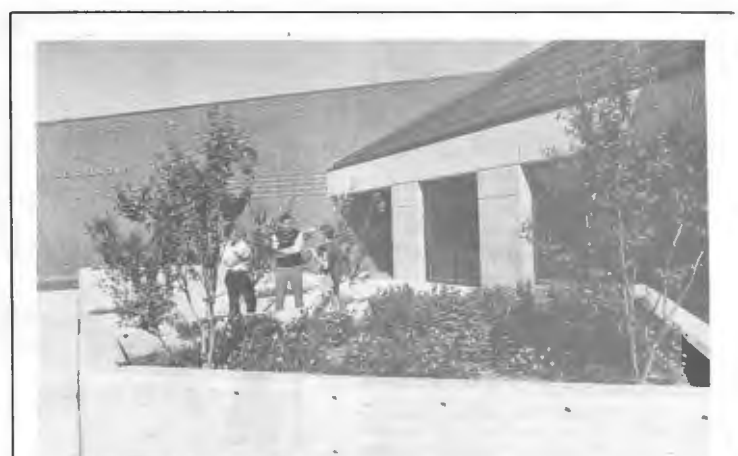
The most tangible evidence of the Centennial Campaign's success is the new physical education center dedicated earlier this year.

excellence in a spiritual environment. IN ALL THAT IS DONE "TO GOD BE THE GLORY."