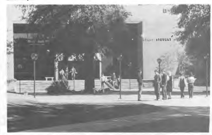
A decade of progress is evident in Evans Student Center, the first building in the long-range plan envisioned by the administration working with the school's architects.