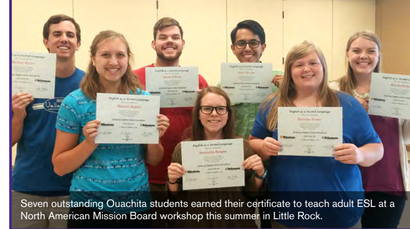
Seven outstanding Ouachita students earned their certificate to teach adult ESL at a North American Mission Board workshop this summer in Little Rock.

It has been such a great experience here at OBU. Growing academically and spiritually within a diverse community has been a blessing, and I am happy to call OBU home. I look forward to building deeper relationships with the people I can call my family away from home.