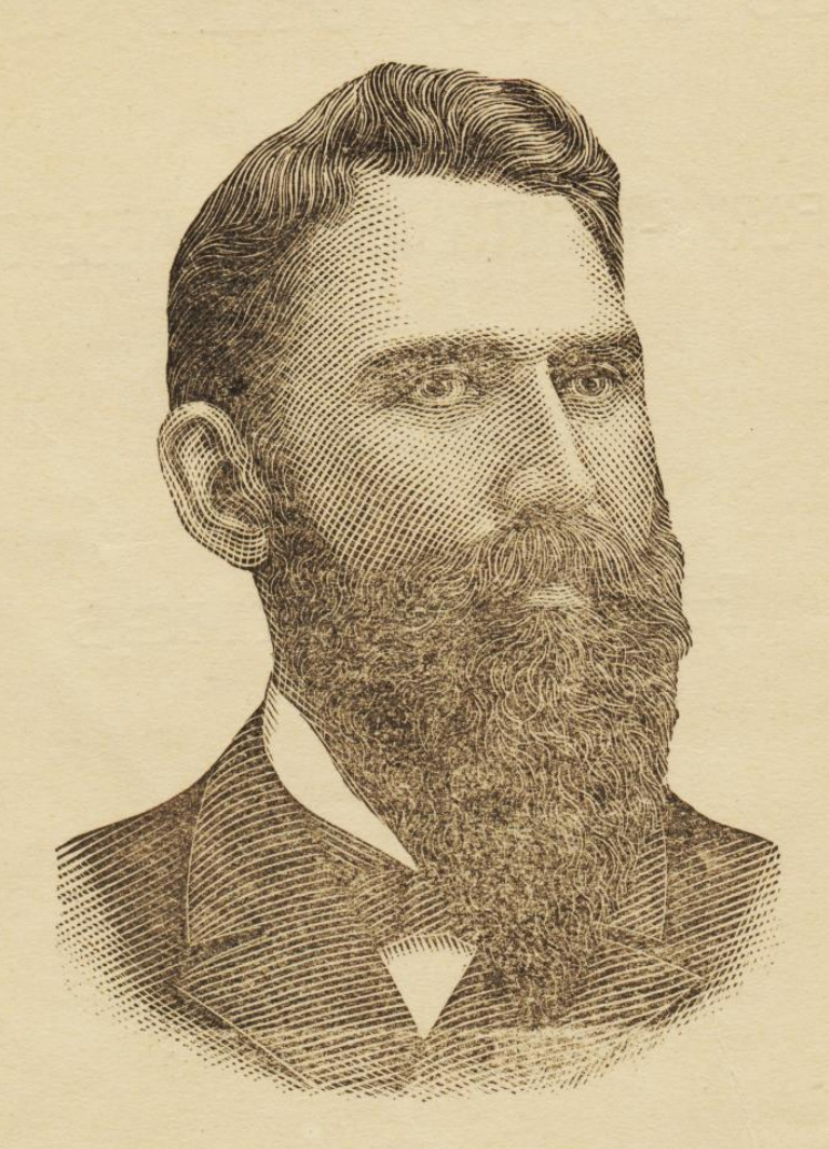
JAMES P. EAGLE, Ex-Governor of Arkansas, and President of Baptist State Convention.