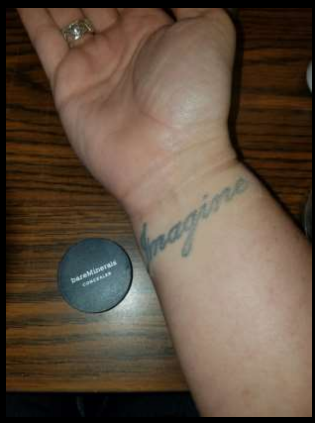
Bare Minerals Concealer in Light 1 applied using sponge applicator