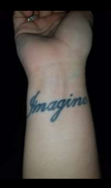
Pre-Step: Applied coconut oil as moisturizer /primer