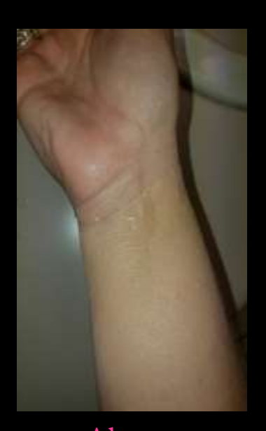
Above: Coverage after held under running water for 5 minutes