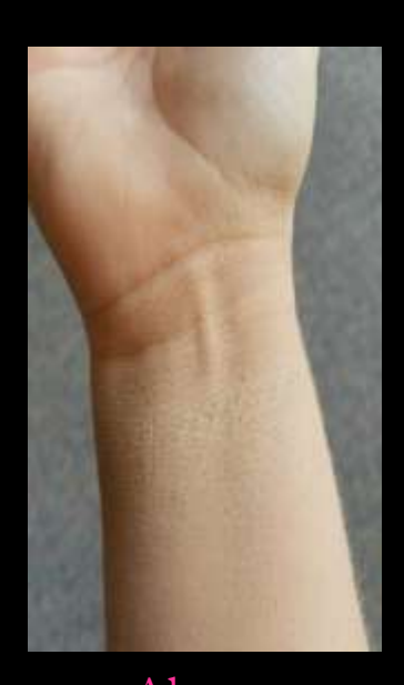
Above: Coverage after towel drying and brushing against clothing

*Note: Ben Nye has consistently been shown to crumble after extended wear