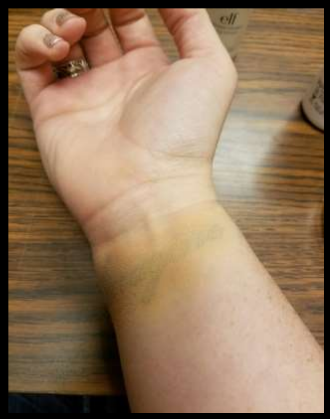
Bare Minerals Original Foundation Powder in Fairly Light applied with Bare Minerals Maximum Coverage Concealer Brush