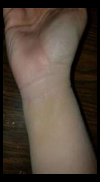
Step 2: Applied P-42 Ultra Beige Ben Nye Crème with sponge and powder set