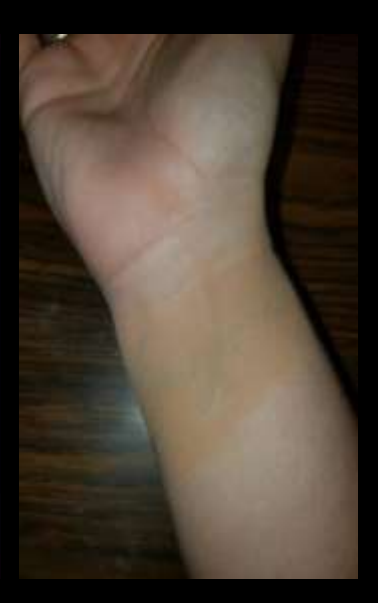
Step 1: Applied p-45 Olive Fair Crème Foundation with sponge and powder set with Ben Nye Translucent Fair Powder