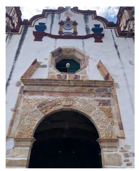
While some traditional Catholicism is practiced in Oaxaca, in general it is the poor and the oppressed who continue to practice and live out their lives in devotion to more of an indigenous Catholicism. In fact, Norget states, "Popular religiosity in Oaxaca can therefore only be understood as religion lived by people who create, sustain, and reproduce it within a social