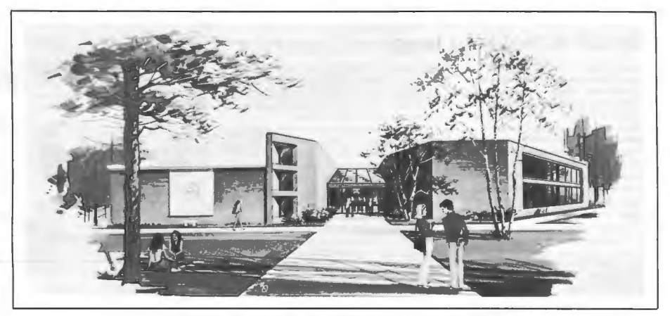
Architect's drawing of the proposed renovation and enlargement of Riley Library.