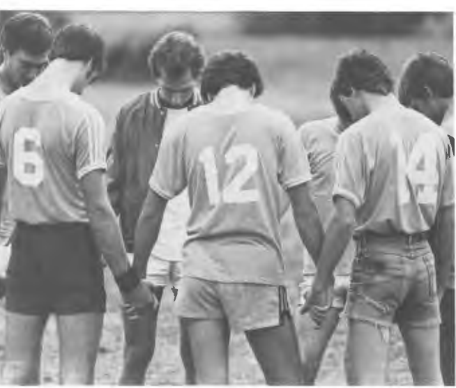
PELE FOLLOWERS — Ouachita's lone club sport, soccer, has claimed a good deal of notoriety in the last decade, due mainly to fondness of the game has caught hold among the other students. OBU has on several occasions claimed the state championship in the part, through the Ouachita Student Senate. Team members engage in a moment of prayer prior to a match during the spring sem ned a good deal of notoriety in the last decade, due mainly to the efforts of MKs whose has on several occasions claimed the state championship in the sport, which is financed, in