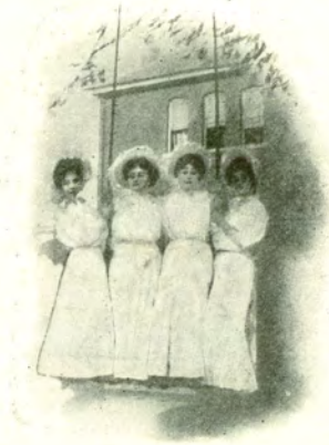
A Jolly Set.