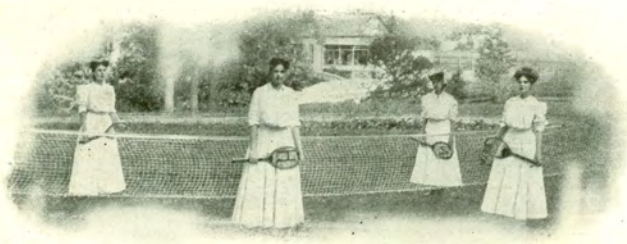
The Queenly Game.