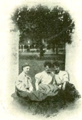
A Campus Chat.