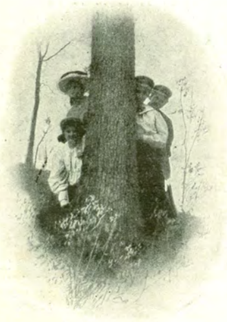
Teacher 's Coming.