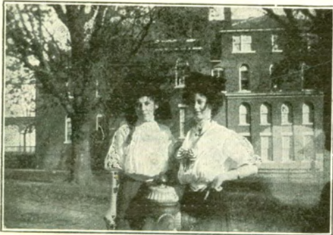
Starting to Town.