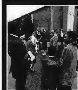
Observe Race Relations Sunday February 12

"We have a good fellowship and an atmosphere that all of us are brothers and sisters in Christ," he said. "That is needed