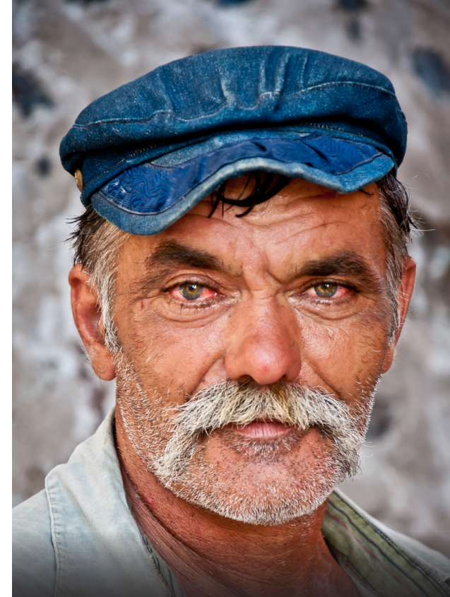
THIS PHOTO, TAKEN IN SANTORINI, GREECE, BY TYLER ROSENTHAL, EARNED FIRST PLACE IN THE GRANT CENTER'S ANNUAL INTERNATIONAL PHOTO CONTEST. THE FRIENDS OF THE GRANT CENTER FUNDED THE CONTEST PRIZES TOTALING $500.

NON-PROFIT ORG. U.S. POSTAGE PAID LITTLE ROCK, AR PERMIT #211