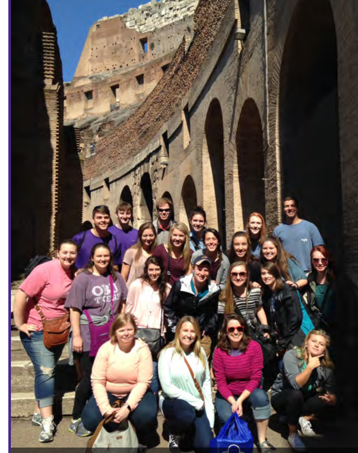
The European Study Tour group visited the Colosseum in Rome.

This year's theme was "East Meets West." In addition to the diverse cuisine, participants enjoyed a variety of music genres as several international students performed songs from their homelands.