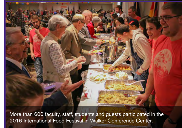
More than 600 faculty, staff, students and guests participated in the 2016 International Food Festival in Walker Conference Center.